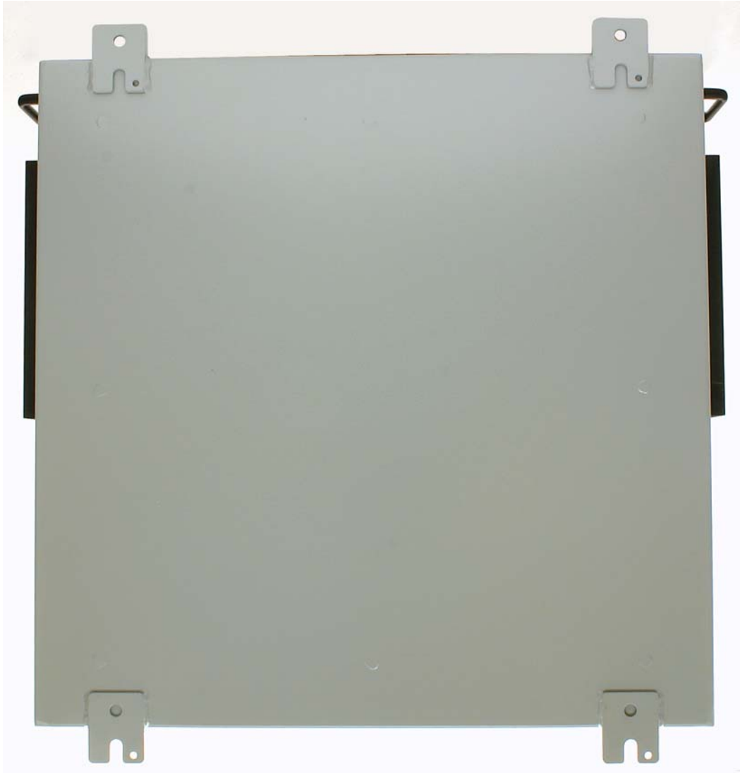
Cabinet Rear View