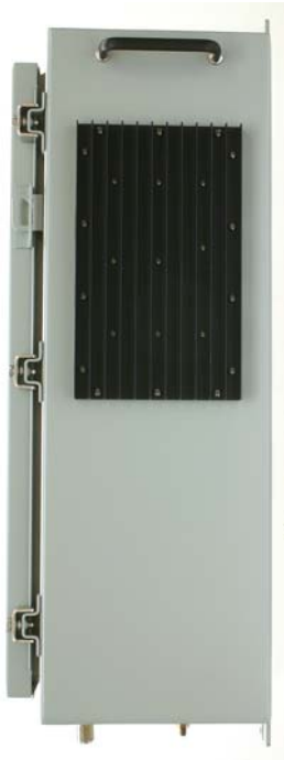
Cabinet Right Side View