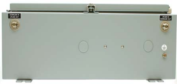
Cabinet Bottom View