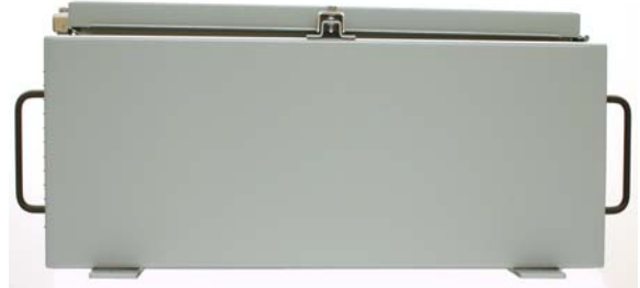
Cabinet Top View