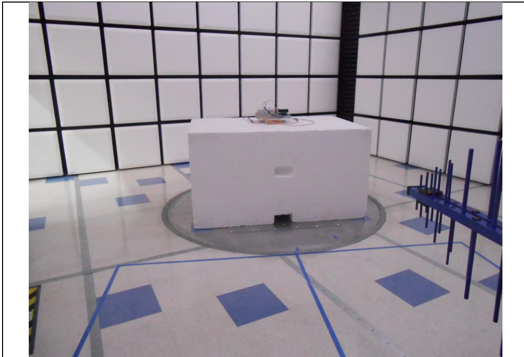
RF Radiated #2