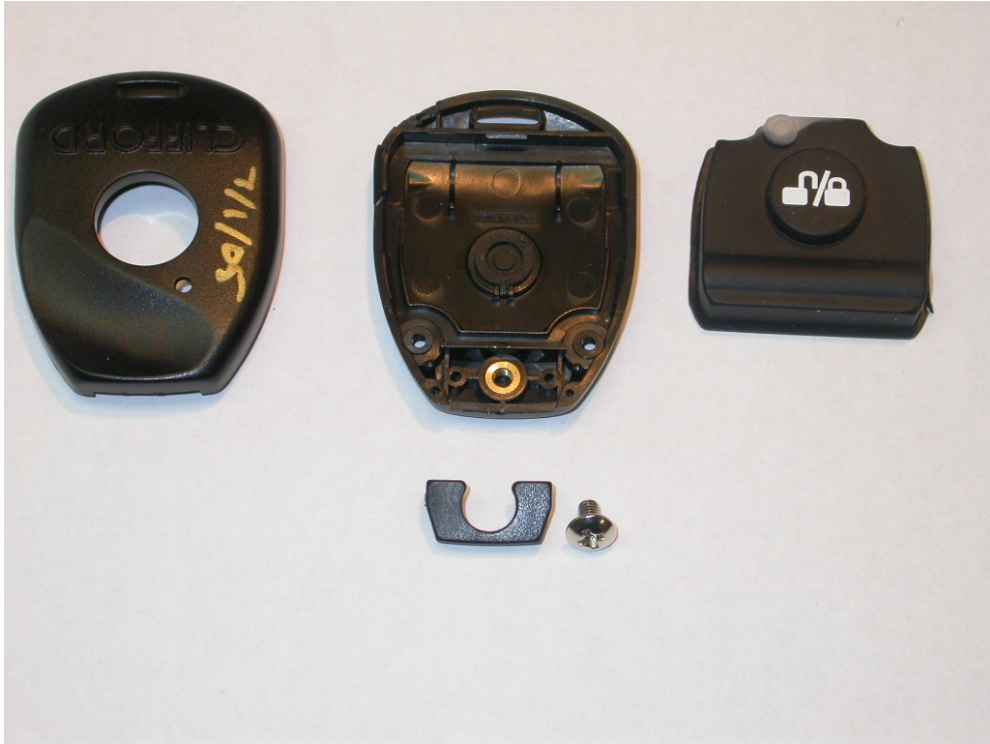
Photo 8 Complete Mechanicals