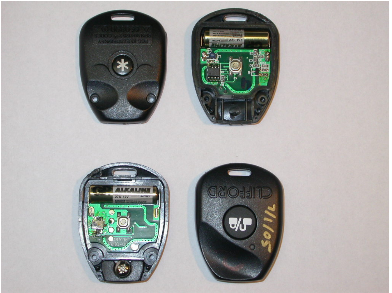
Photo 1 Top and bottom internal