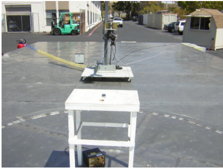
Typical, keyfob radiated emissions