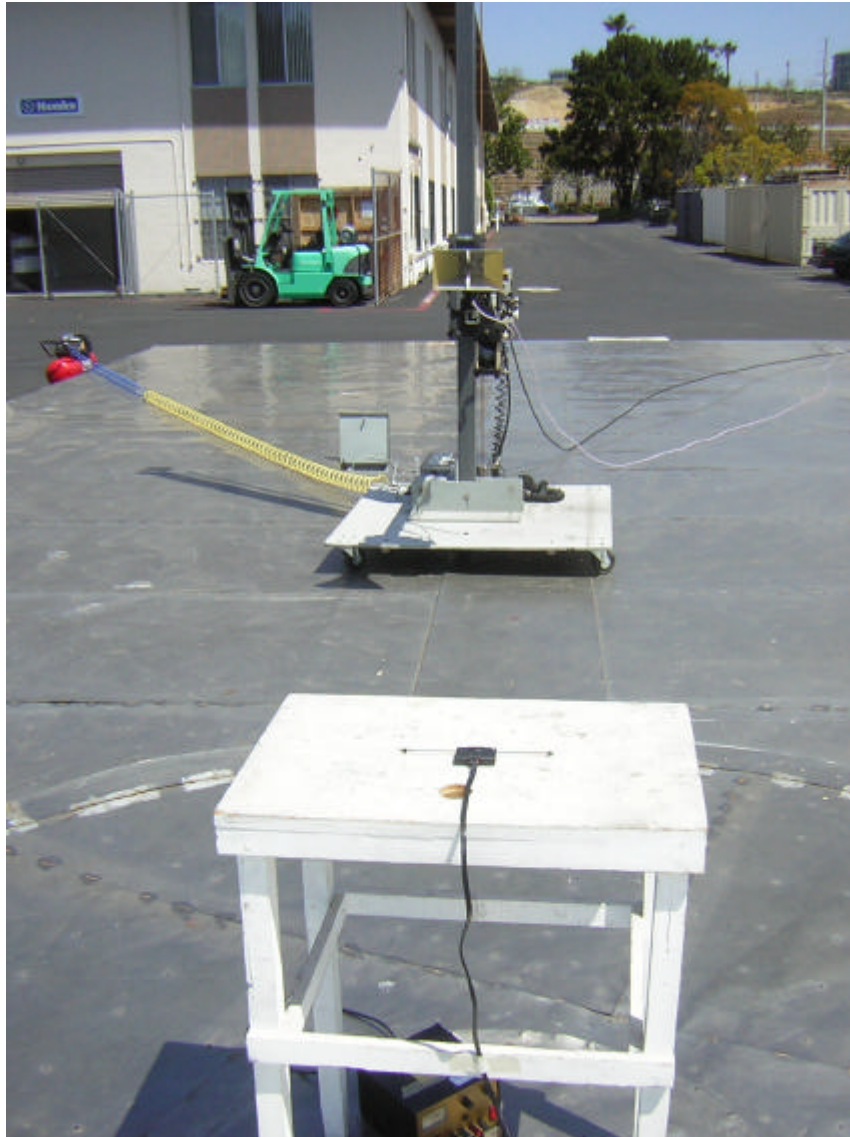
Typical, keyfob radiated emissions