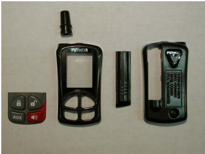
Photo 9 Exploded view of plastic case assembly