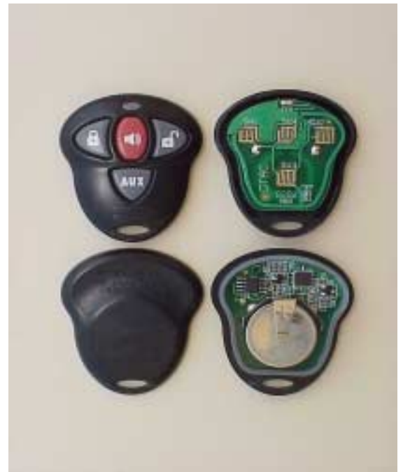
Photo 2 Original 4 button configuration. Again, same PCB is used for either 3 or 4 button configuration.