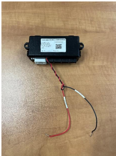
Figure 1 AX09