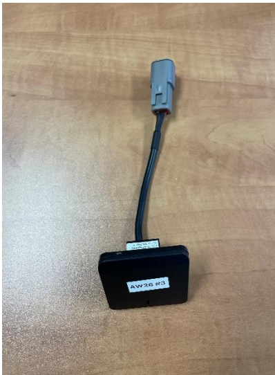
Figure 2 AW26