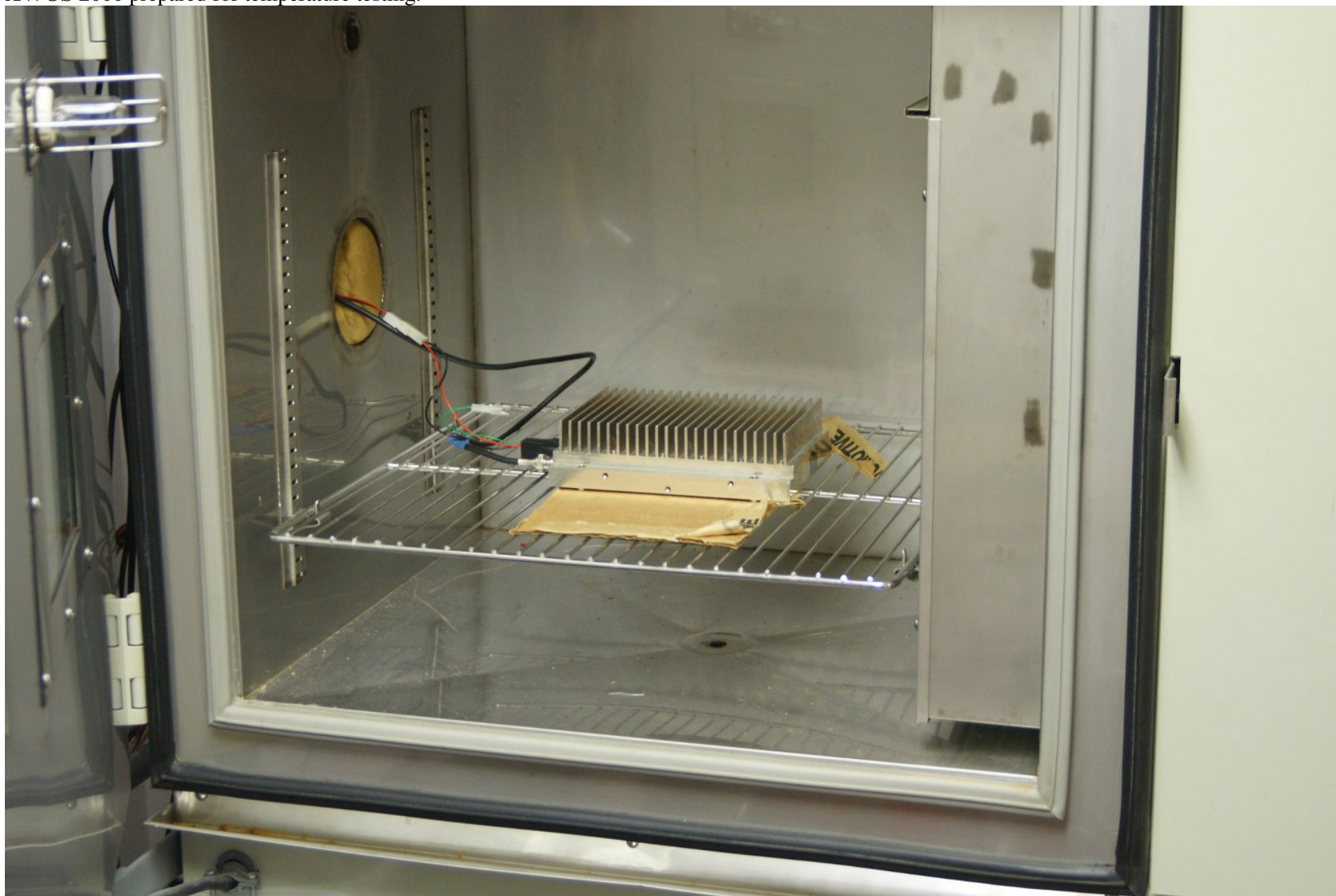
AWOS 2000 prepared for temperature testing.