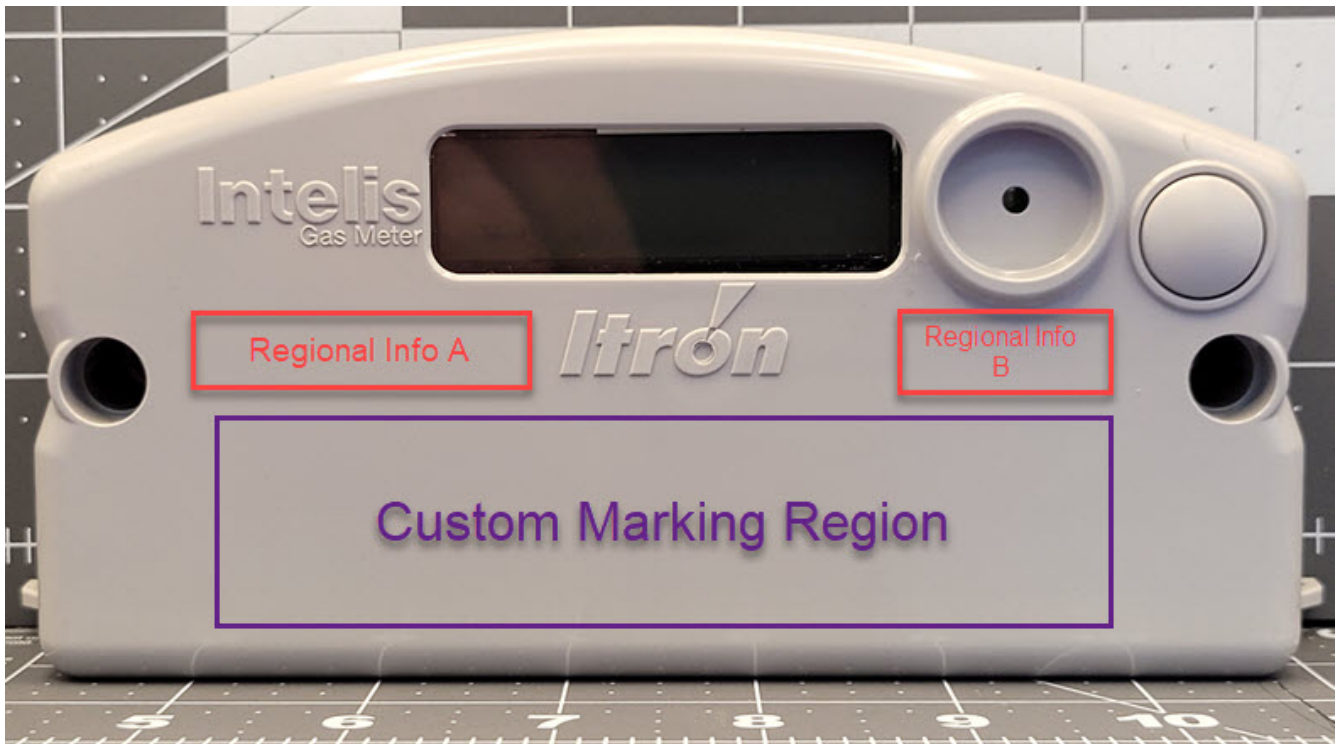
Figure 2.1: Marking Location(s)

Custom Marking Region can be used for customer logos, content, etc.