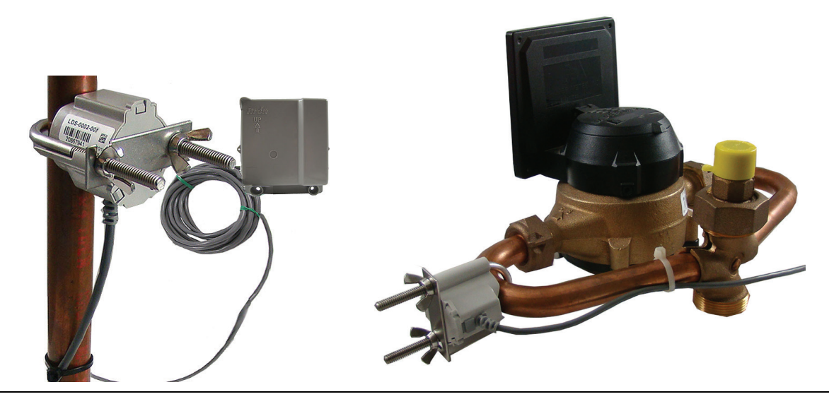
Note Leak Sensor mounting orientation is not critical. Orient the Sensor to best accommodate your installation. The most important installation practice is to mount the Sensor securely to the pipe.