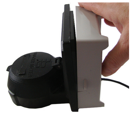
Note A gasket is not required.

5. Place the ERT module on the register, ensuring the edge of the ERT module housing is seated properly around the perimeter of the register as shown below.