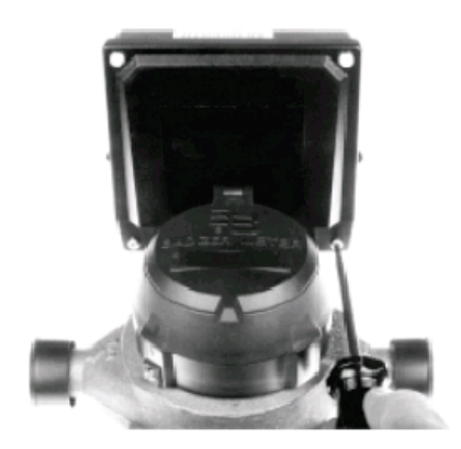
Warning User Itron mounting screws (SCR-0010-005). Using the wrong mounting screws could crack the plastic ERT module housing.

6. Install four Torx-head mounting screws (SCR-0010-005) as shown below and hand-tighten the screws.