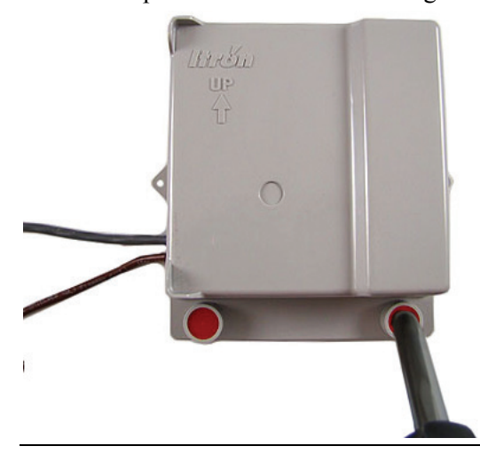
Note A tamper seal is fully seated when the top of the tamper seal is approximately 1/16 inch below the top of the screw recess.

6. Insert a tamper seal over each mounting screw and drive into place with a nut driver or a similar tool.