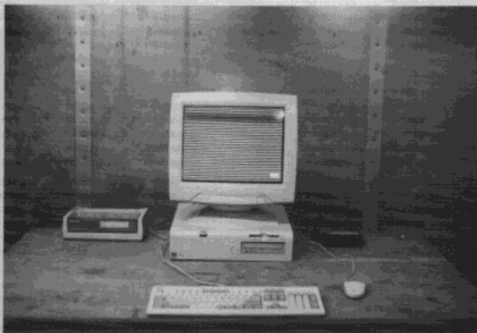
Photograph 1: Setup for Conducted Emission (640x480 H=31.5kHz)