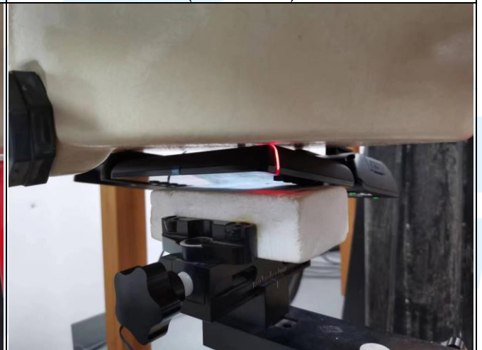
Rear Face of EUT with 0 cm Gap (5GHz Wi-Fi)