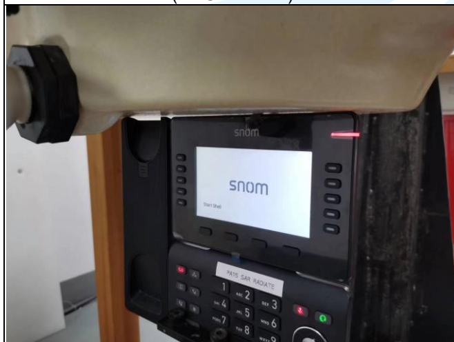
Top Side of EUT with 0 cm Gap (2.4GHz Wi-Fi)