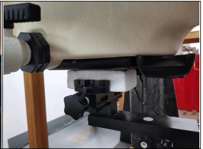
Front Face of EUT with 0 cm Gap (5GHz Wi-Fi)