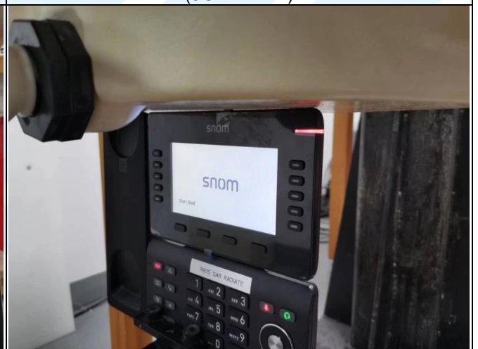
Top Side of EUT with 0 cm Gap (5GHz Wi-Fi)