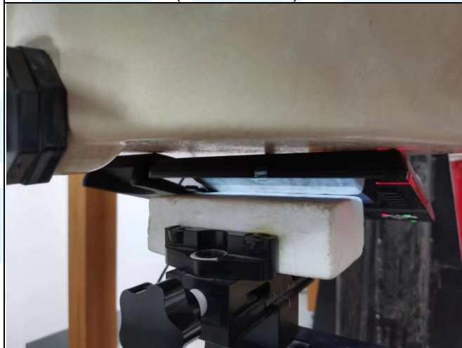
Rear Face of EUT with 0 cm Gap (2.4GHz Wi-Fi)