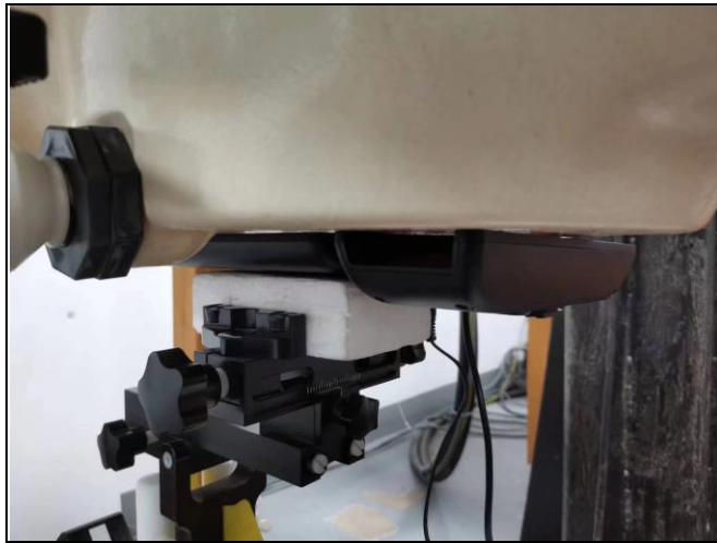
Front Face of EUT with 0 cm Gap (2.4GHz Wi-Fi)