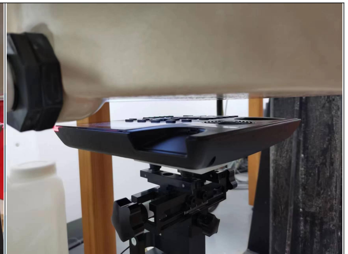
Front Face of EUT with 2.5 cm Gap (5GHz Wi-Fi)