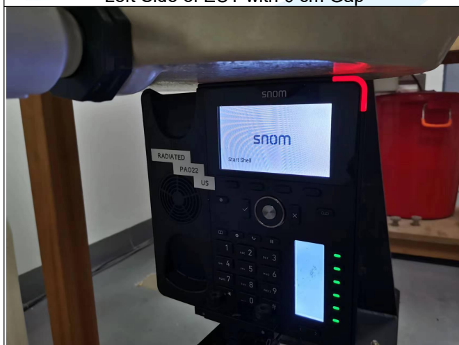
Top Side of EUT with 0 cm Gap