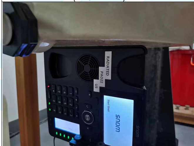
Left Side of EUT with 0 cm Gap