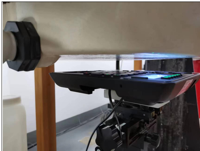
Front Face of EUT with 2.5 cm Gap (2.4GHz Wi-Fi)