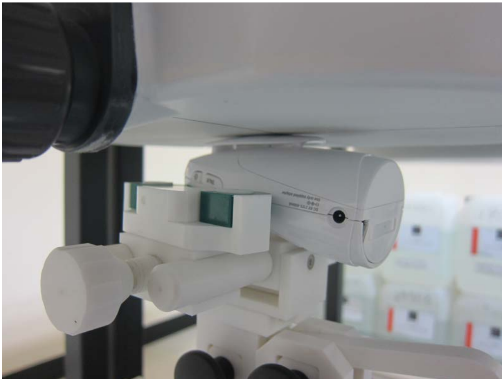
Figure 2 – Back surface with 0mm Separation