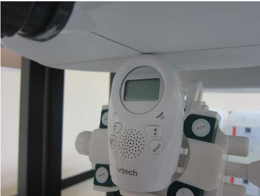
Figure 4 – Top surface with 0mm Separation