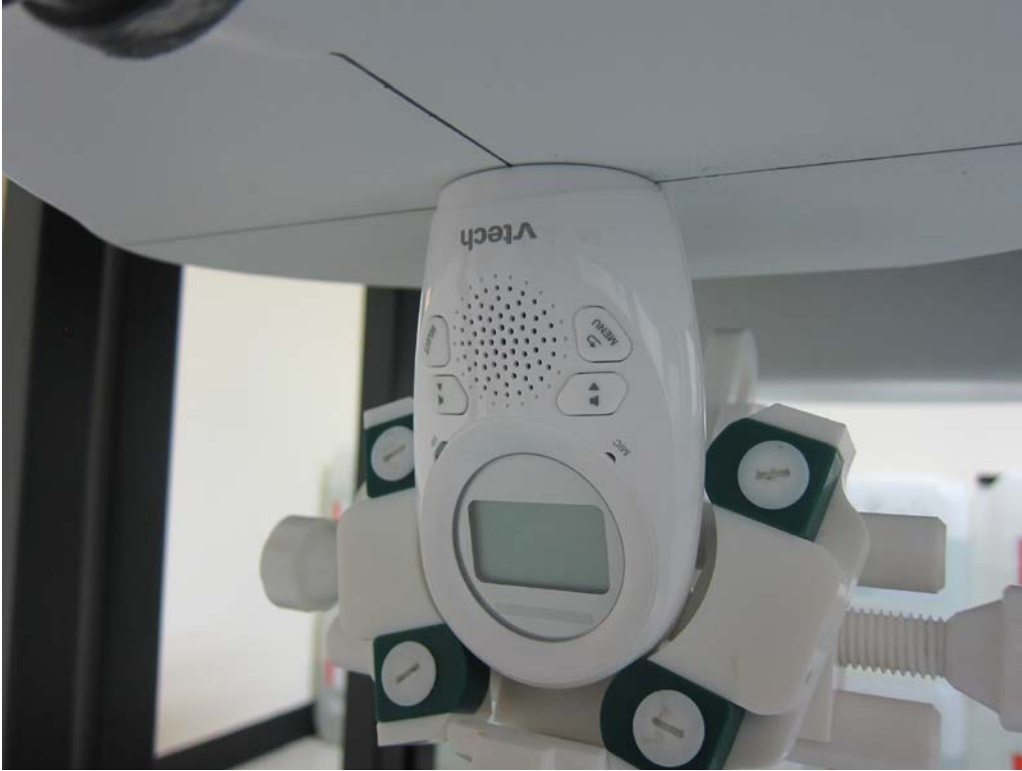
Figure 7 – Bottom surface with 0mm Separation