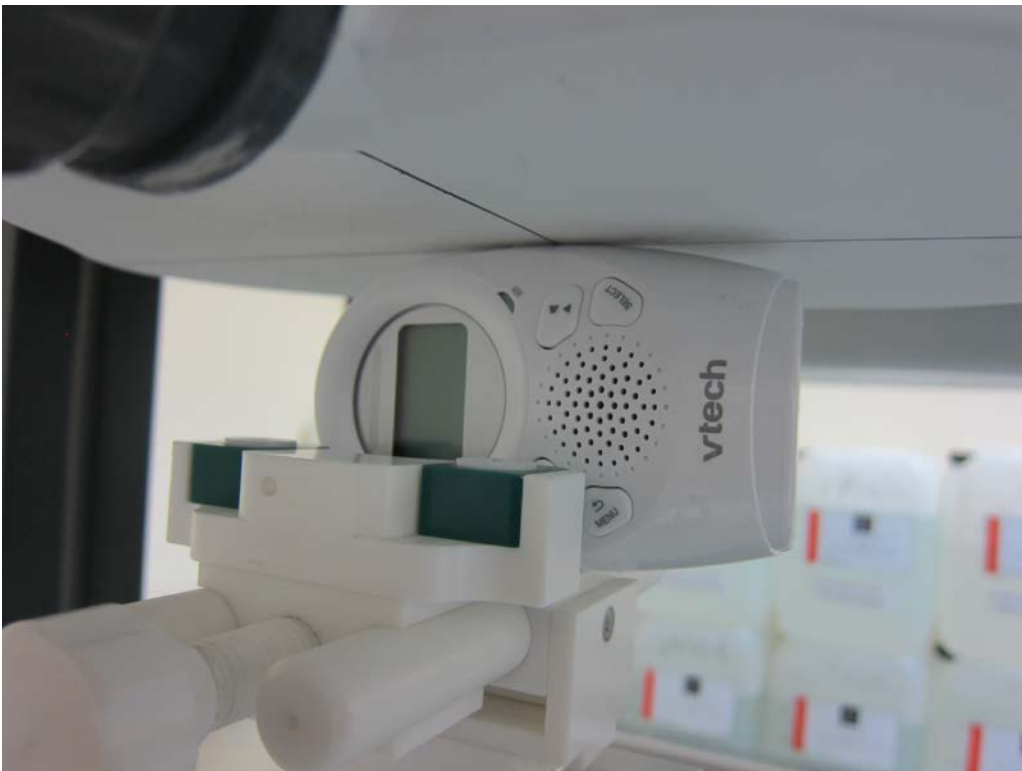
Figure 6 – Right surface with 0mm Separation