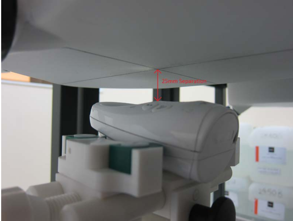
Figure 1 – Front surface with 25mm Separation