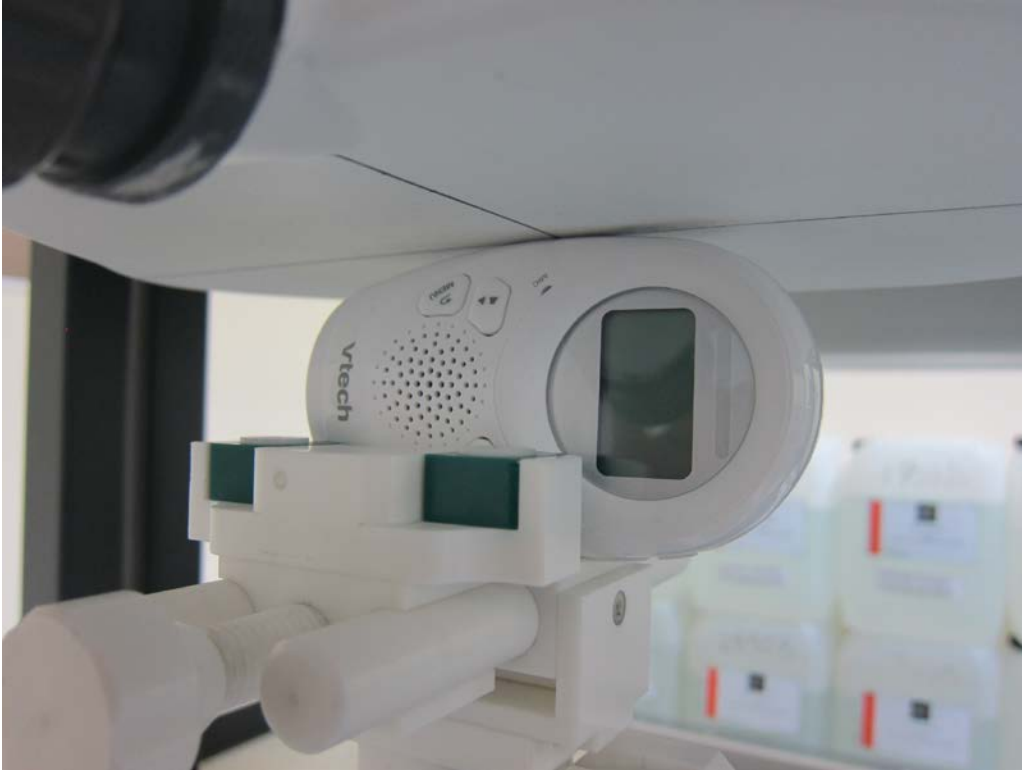
Figure 5 – Left surface with 0mm Separation