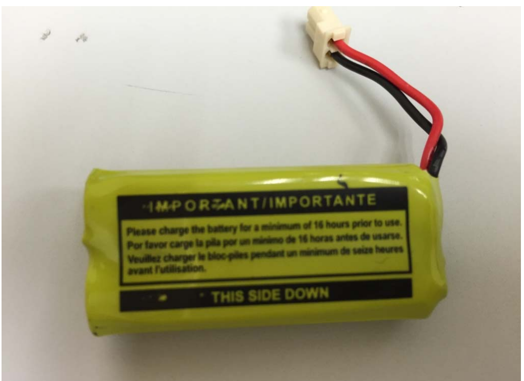
Figure 4 – 2.4V 750mAh Ni-MH GPI rechargeable battery back view