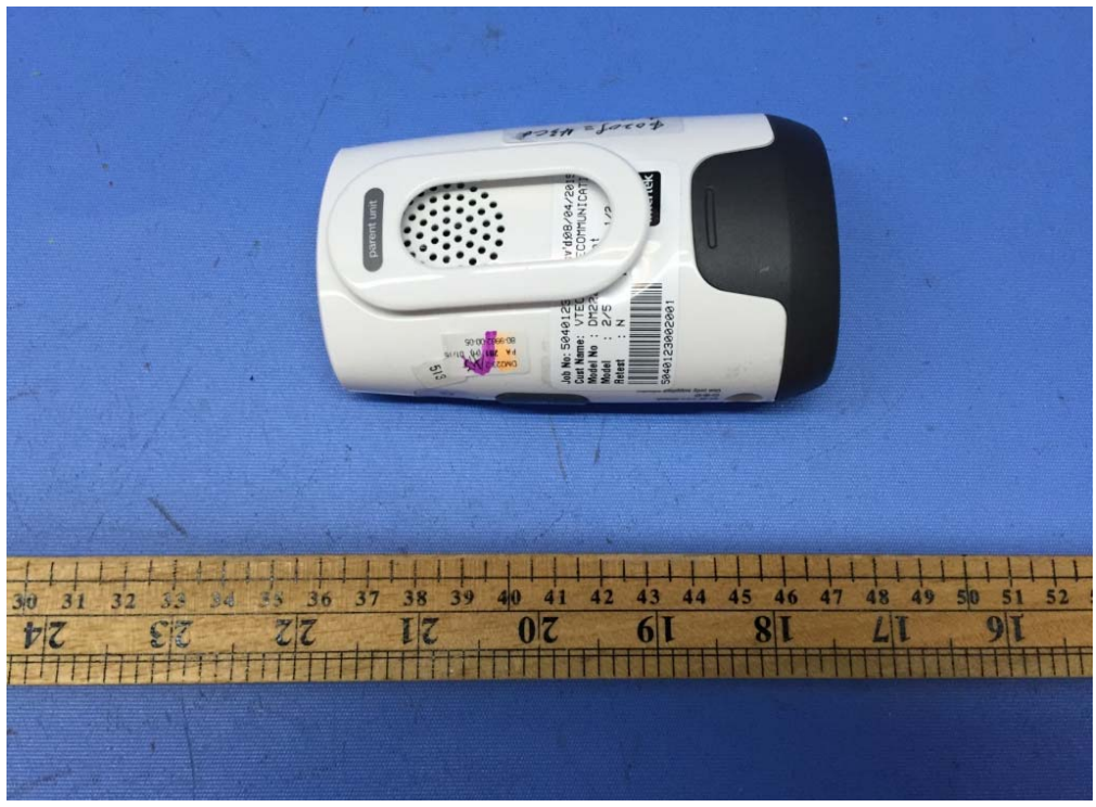
Figure 2 – DM202 Parent Unit Back view