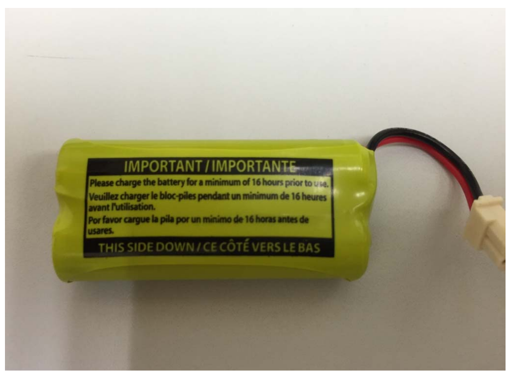
Figure 6 – 2.4V 750mAh Ni-MH Corun rechargeable battery back view