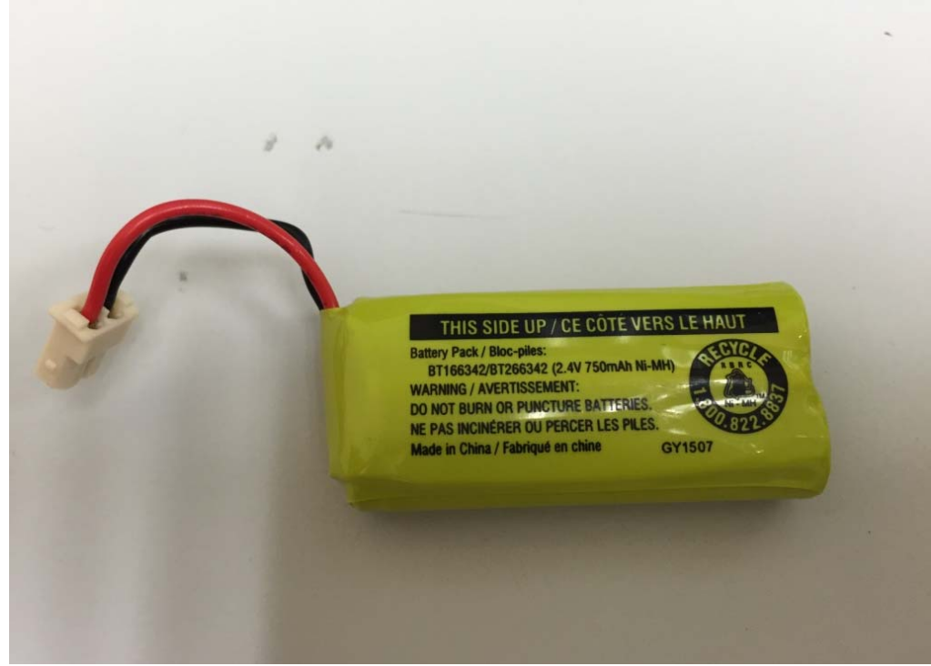
Figure 7 – 2.4V 750mAh Ni-MH Coslight rechargeable battery front view