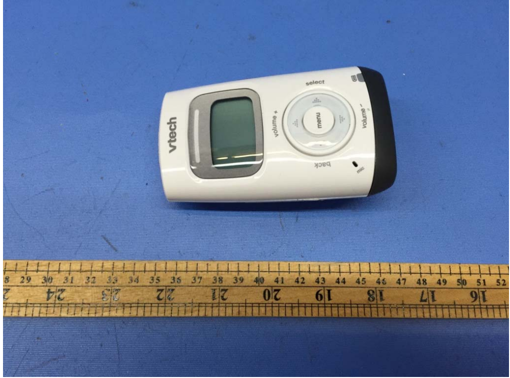
Figure 1 – DM202 Parent Unit Front view