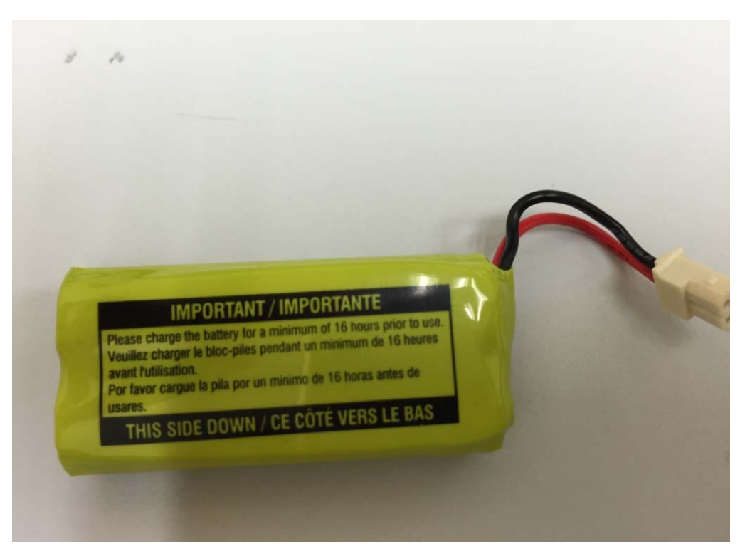
Figure 8 – 2.4V 750mAh Ni-MH Coslight rechargeable battery back view