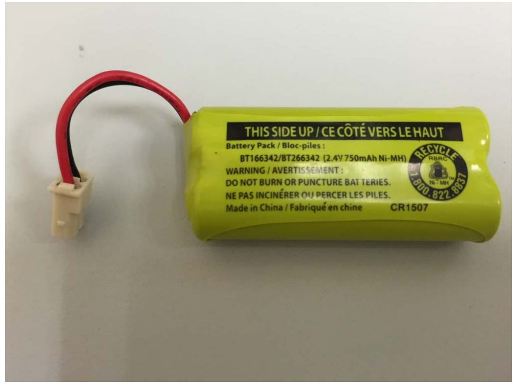
Figure 5 – 2.4V 750mAh Ni-MH Corun rechargeable battery front view