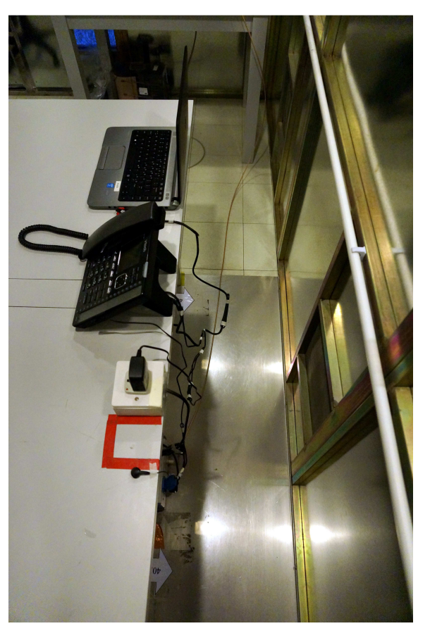
Side View 1