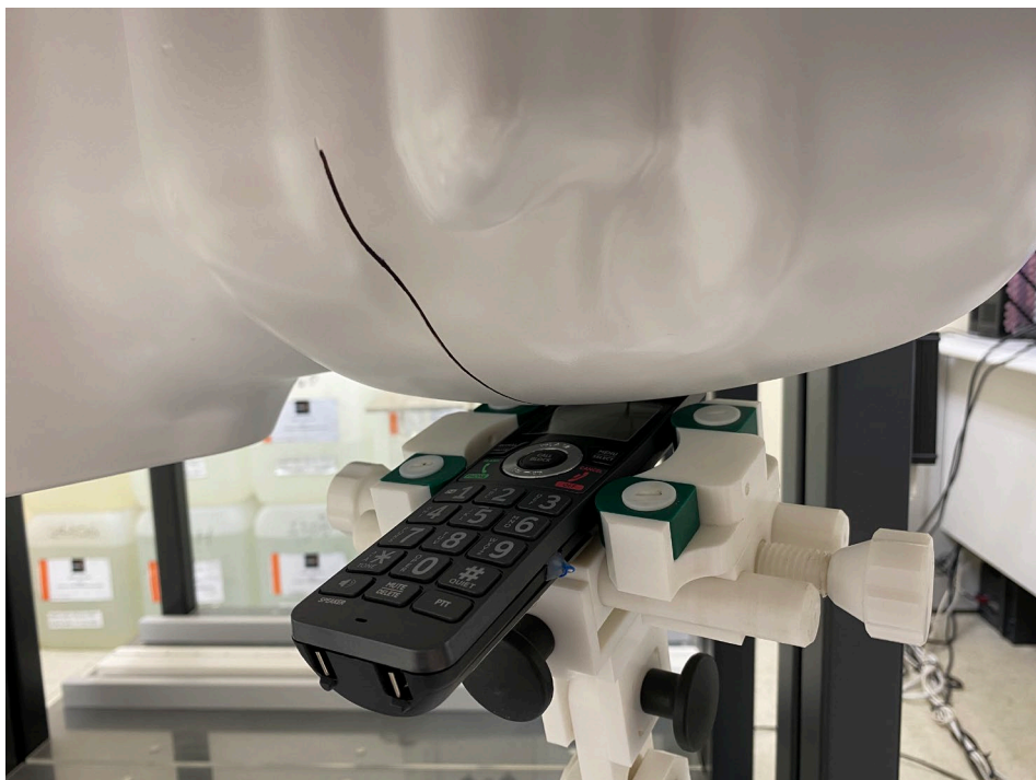
Figure 2 – Right Tilt