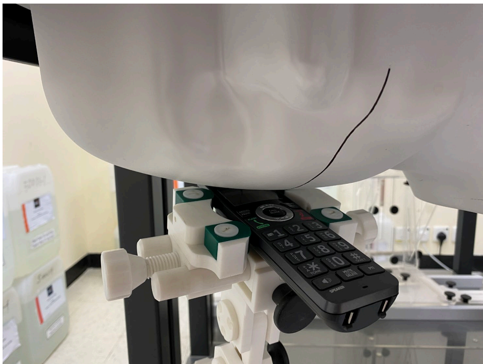
Figure 4 – Left Tilt