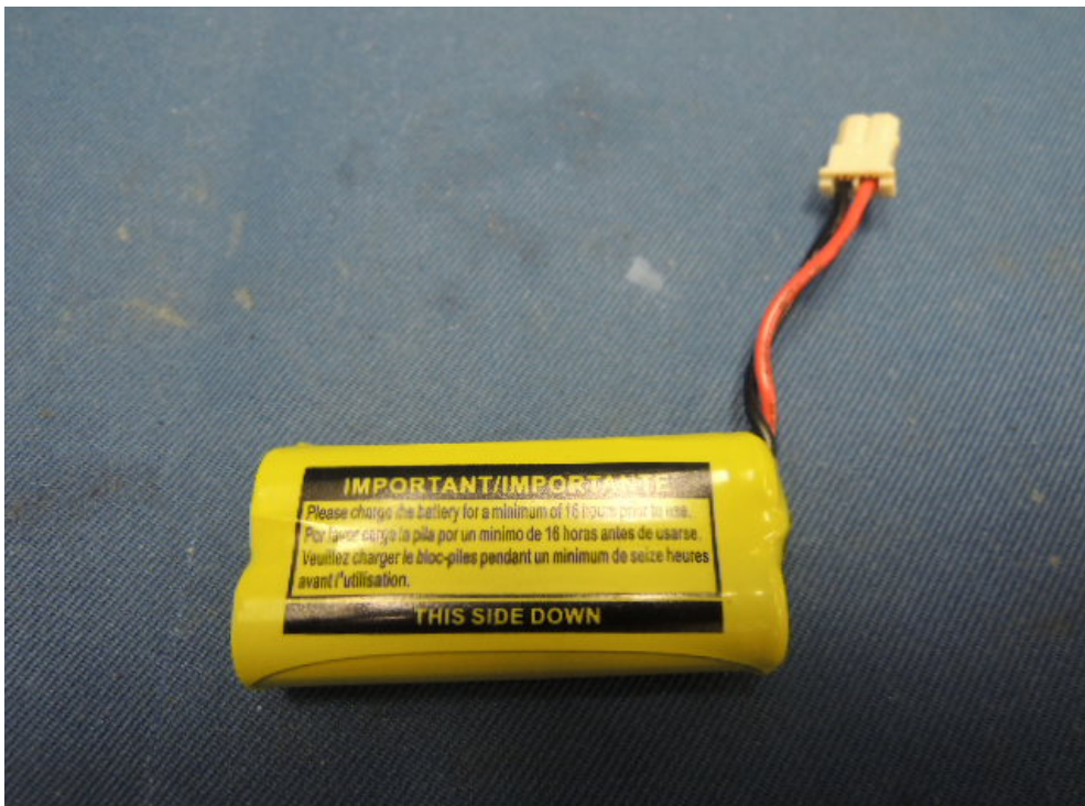
Figure 4 – 2.4V 550mAh Ni-MH Corun rechargeable battery back view