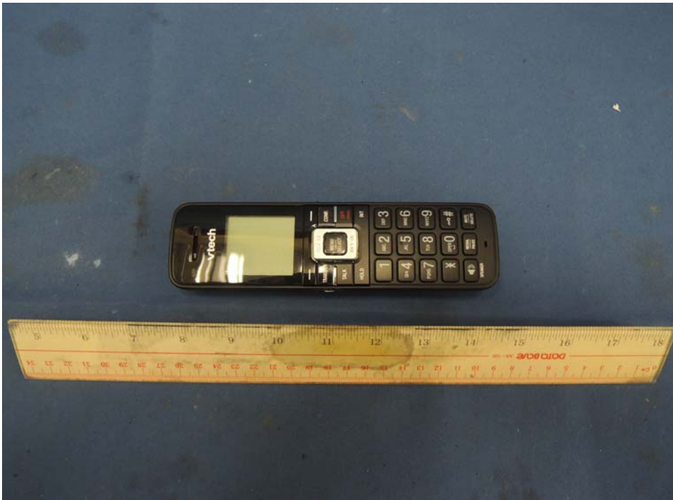
Figure 1 – Handset Unit front view