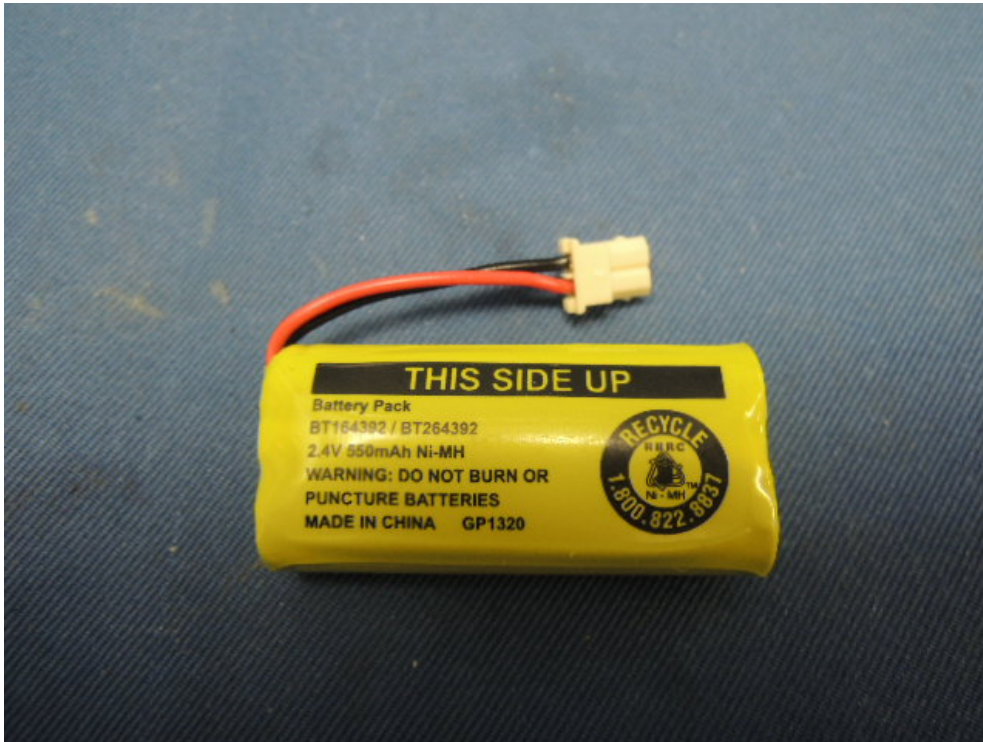
Figure 7 – 2.4V 550mAh Ni-MH GP rechargeable battery front view