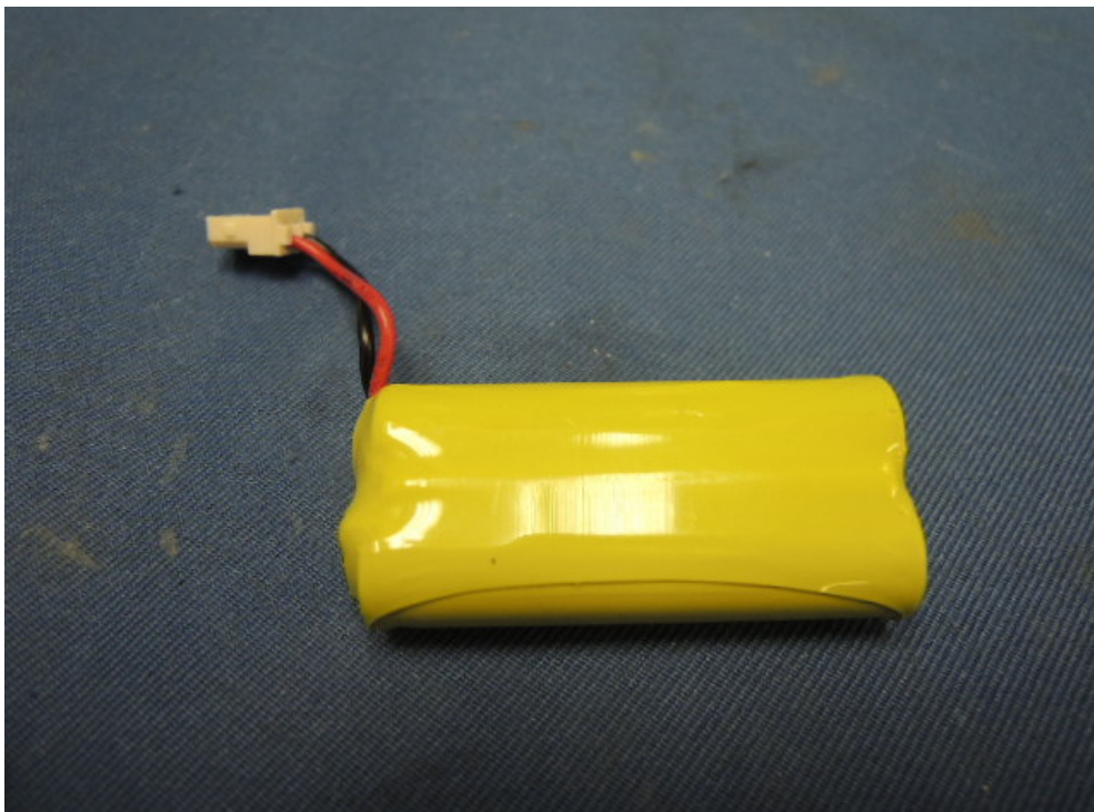
Figure 6 – 2.4V 550mAh Ni-MH Coslight rechargeable battery back view