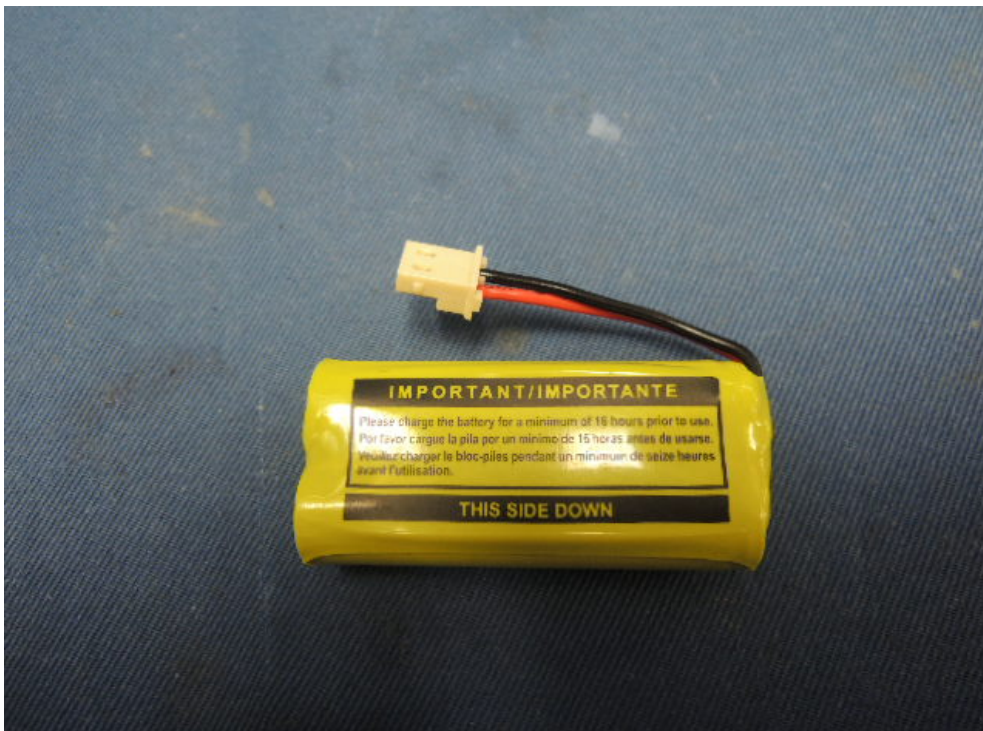
Figure 8 – 2.4V 550mAh Ni-MH GP rechargeable battery back view