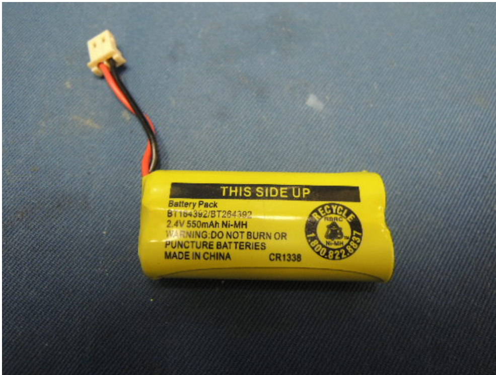
Figure 3 – 2.4V 550mAh Ni-MH Corun rechargeable battery front view