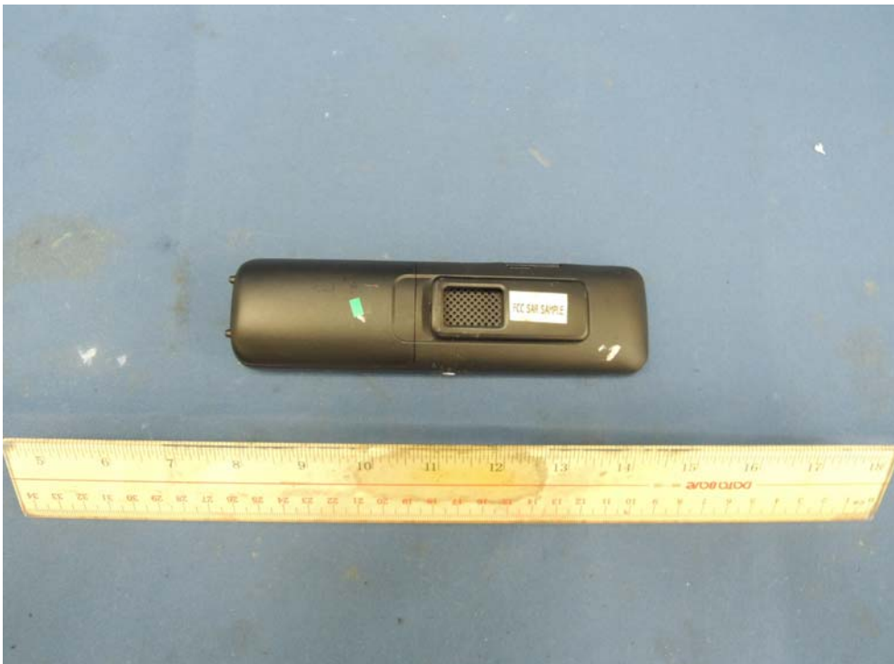
Figure 2 – Handset Unit back view