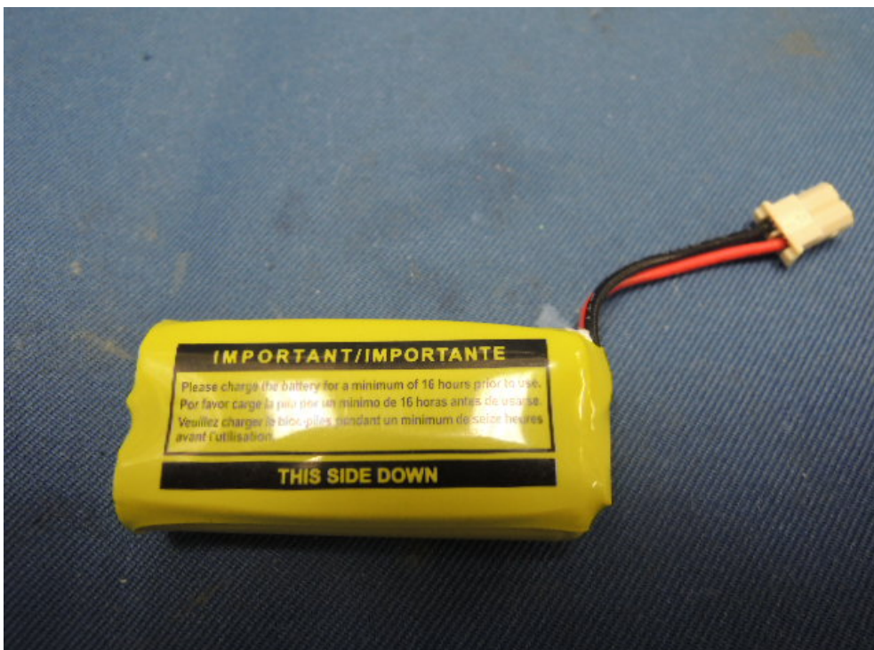
Figure 12 – 2.4V 750mAh Ni-MH GP rechargeable battery back view