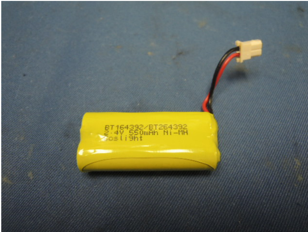
Figure 5 – 2.4V 550mAh Ni-MH Coslight rechargeable battery front view