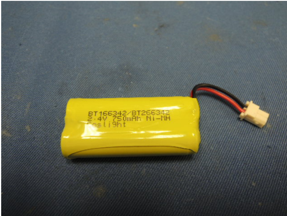
Figure 9 – 2.4V 750mAh Ni-MH Coslight rechargeable battery front view