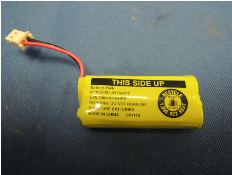
Figure 11 – 2.4V 750mAh Ni-MH GP rechargeable battery front view