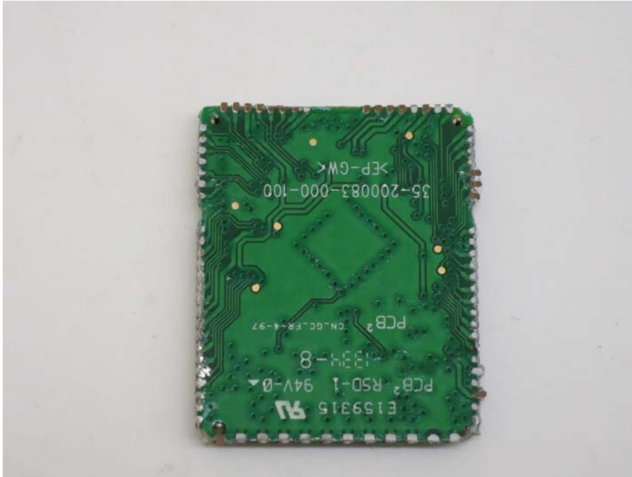
Handset Oscillator PCB solder side