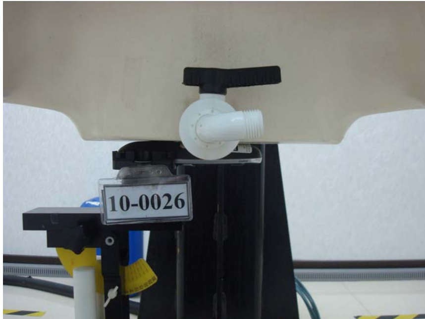
Figure 6. Body SAR Test Setup (Flat Section)