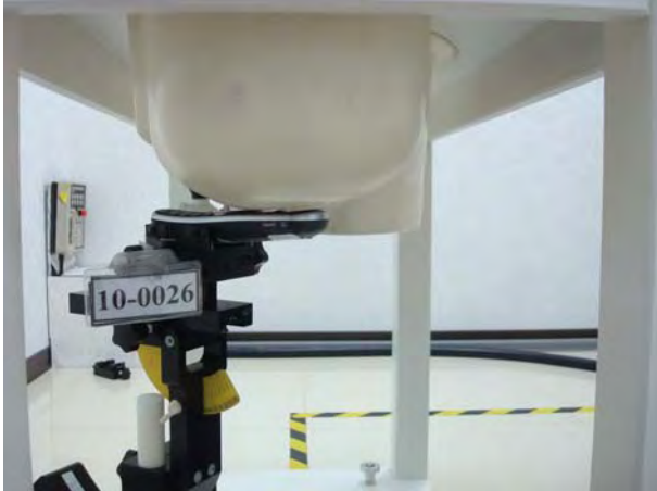
Figure 4. Left Head SAR Test Setup (Cheek)