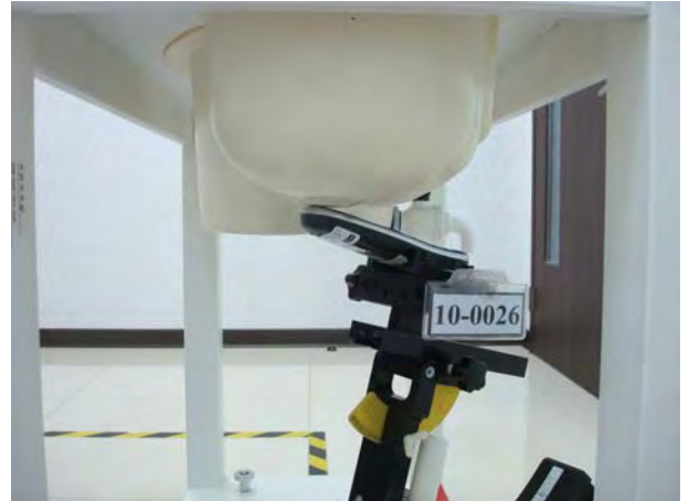
Figure 3. Right Head SAR Test Setup (Tilted)