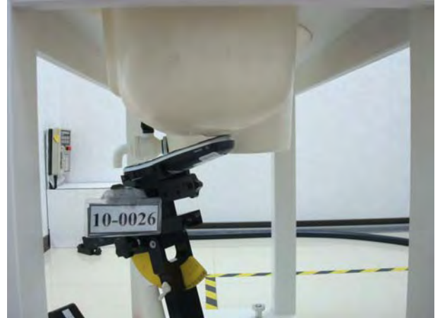
Figure 5. Left Head SAR Test Setup (Tilted)