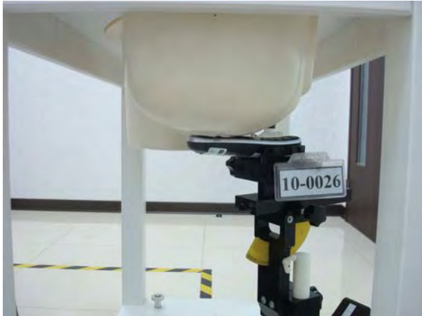
Figure 2. Right Head SAR Test Setup (Cheek)