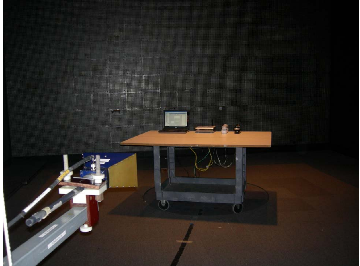
Figure 1: Radiated Emissions