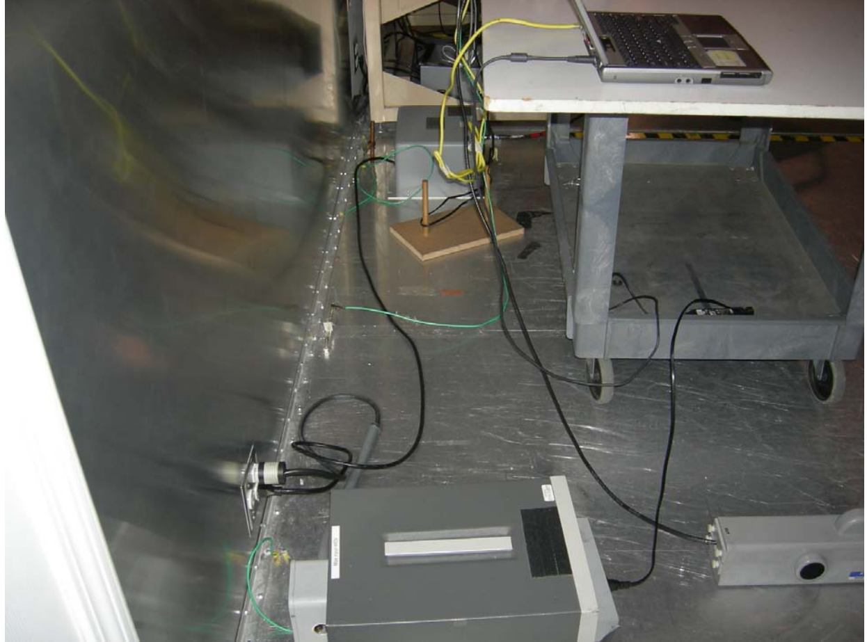
Figure 4: AC Power Line Conducted Emissions