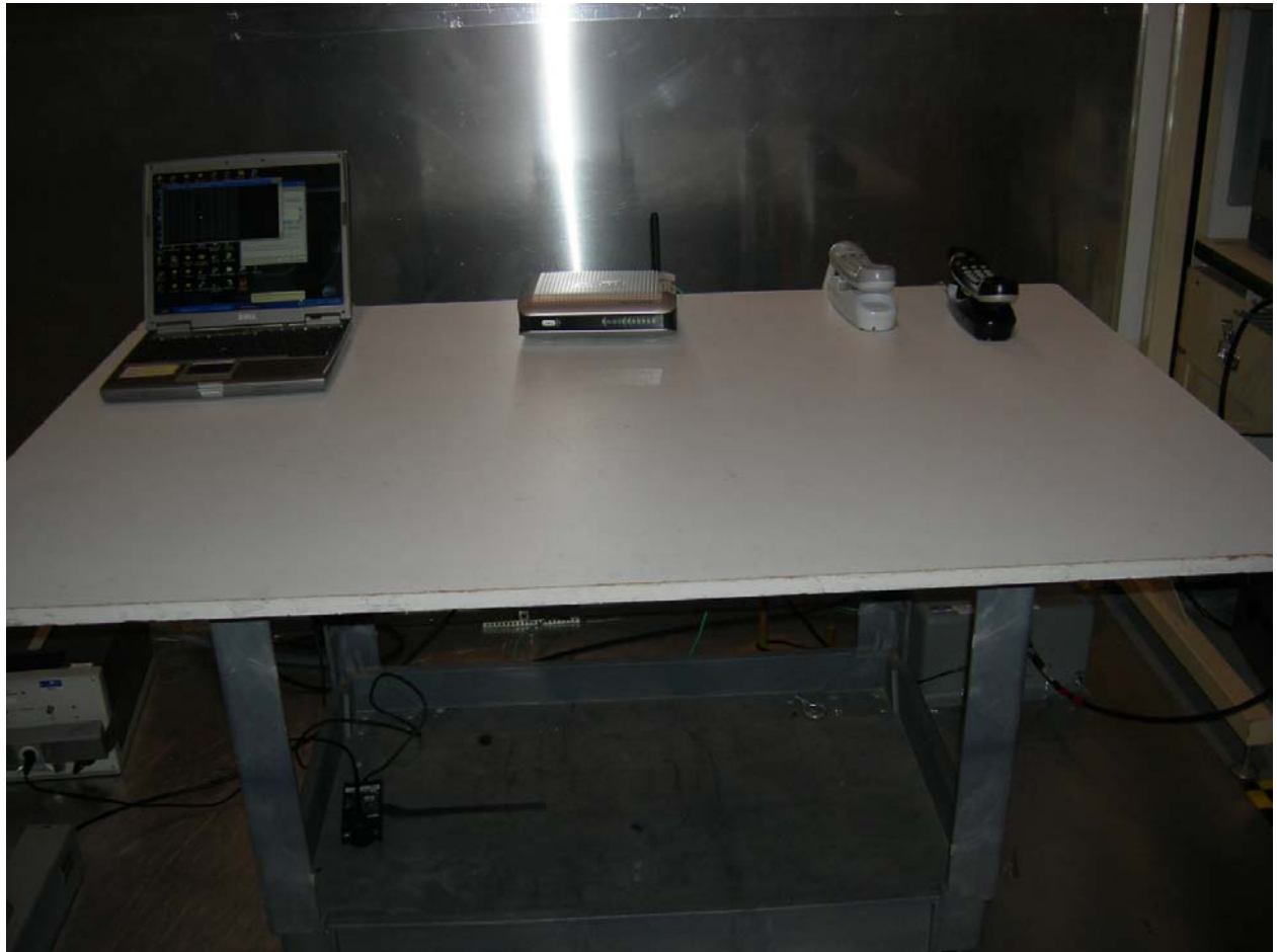
Figure 3: AC Power Line Conducted Emissions