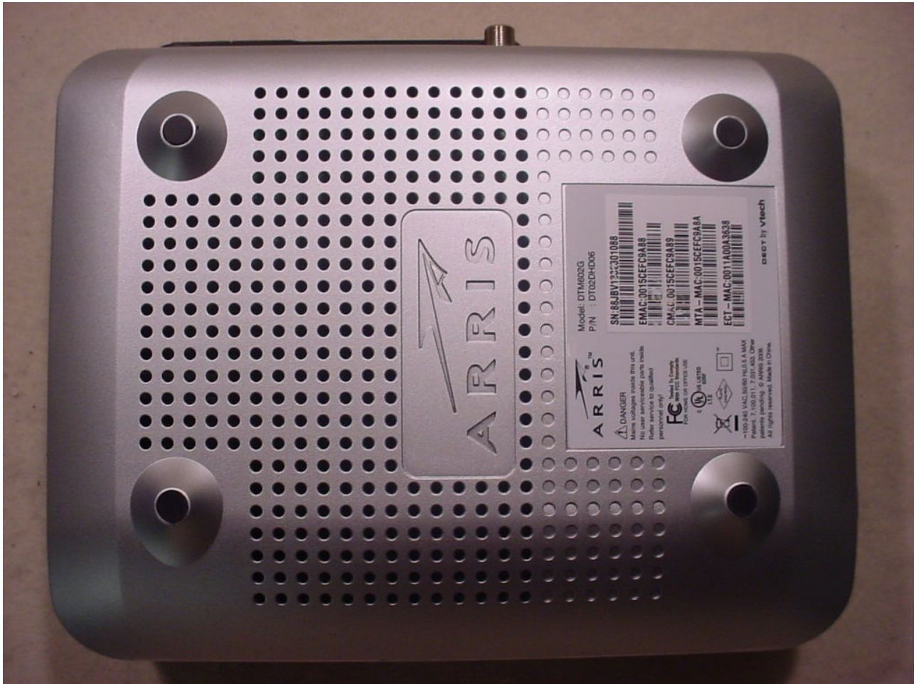
Figure 4: Model Designation Label Location