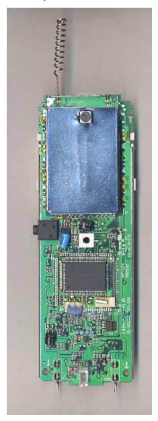
EUT – Component View