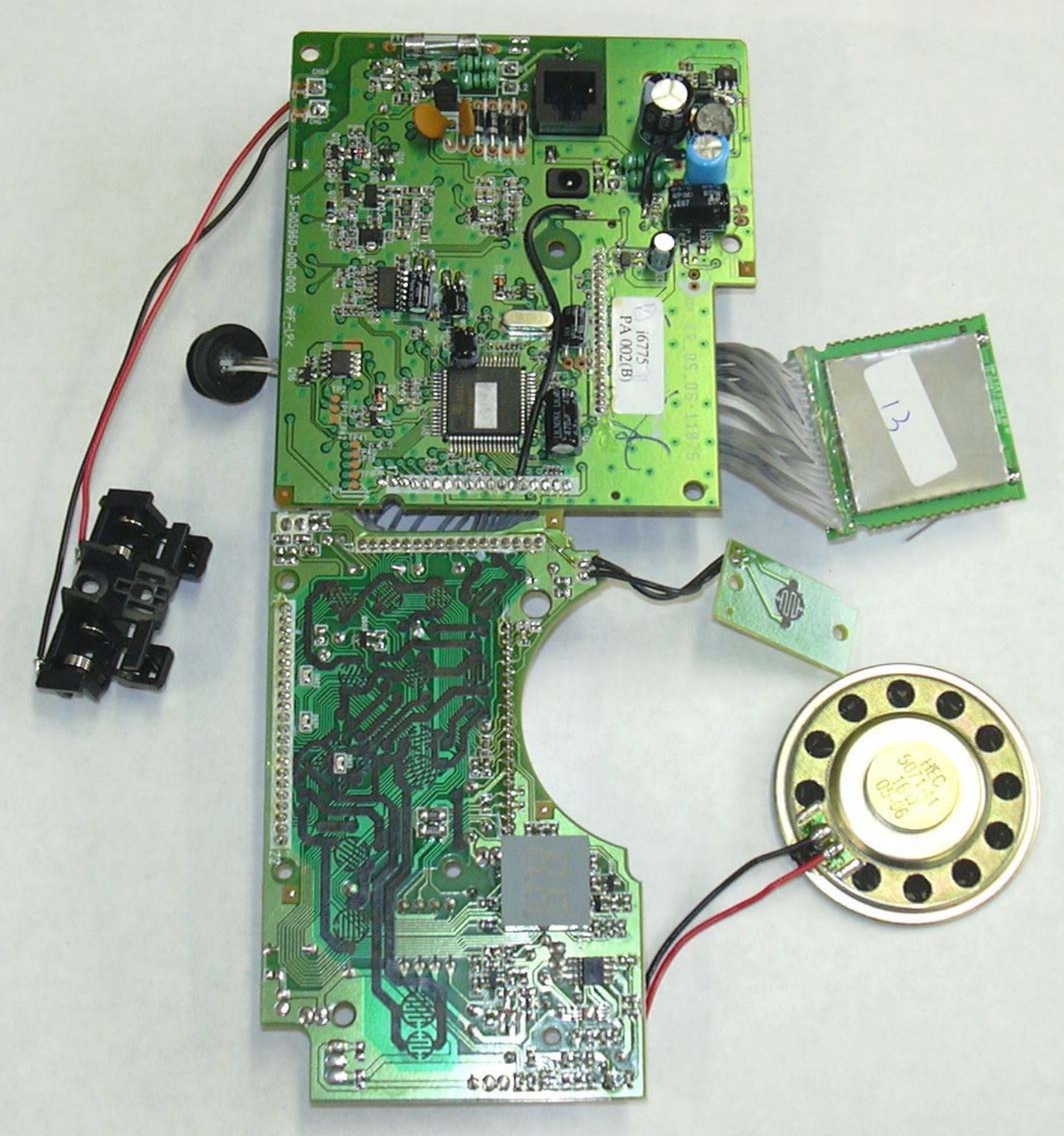
VTech I6775 Base PCB