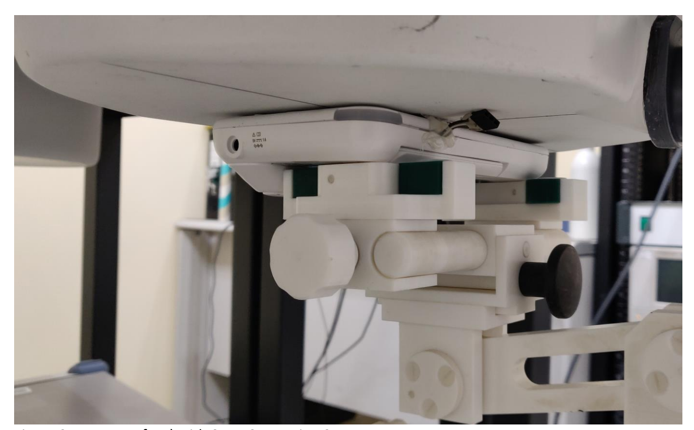
Figure 2 – Front surface) with 0mm Separation 2