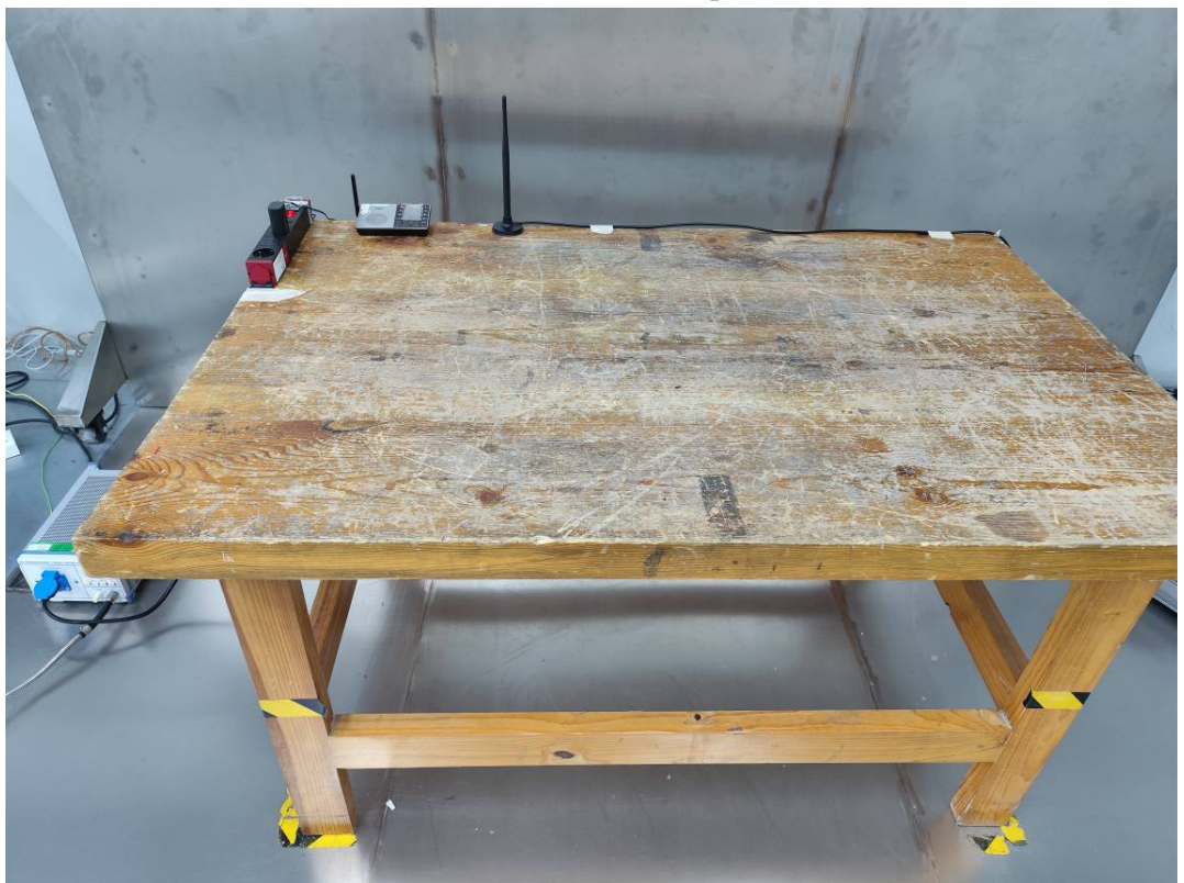
Conducted Emissions Front View-Adapter VT05EUS05100