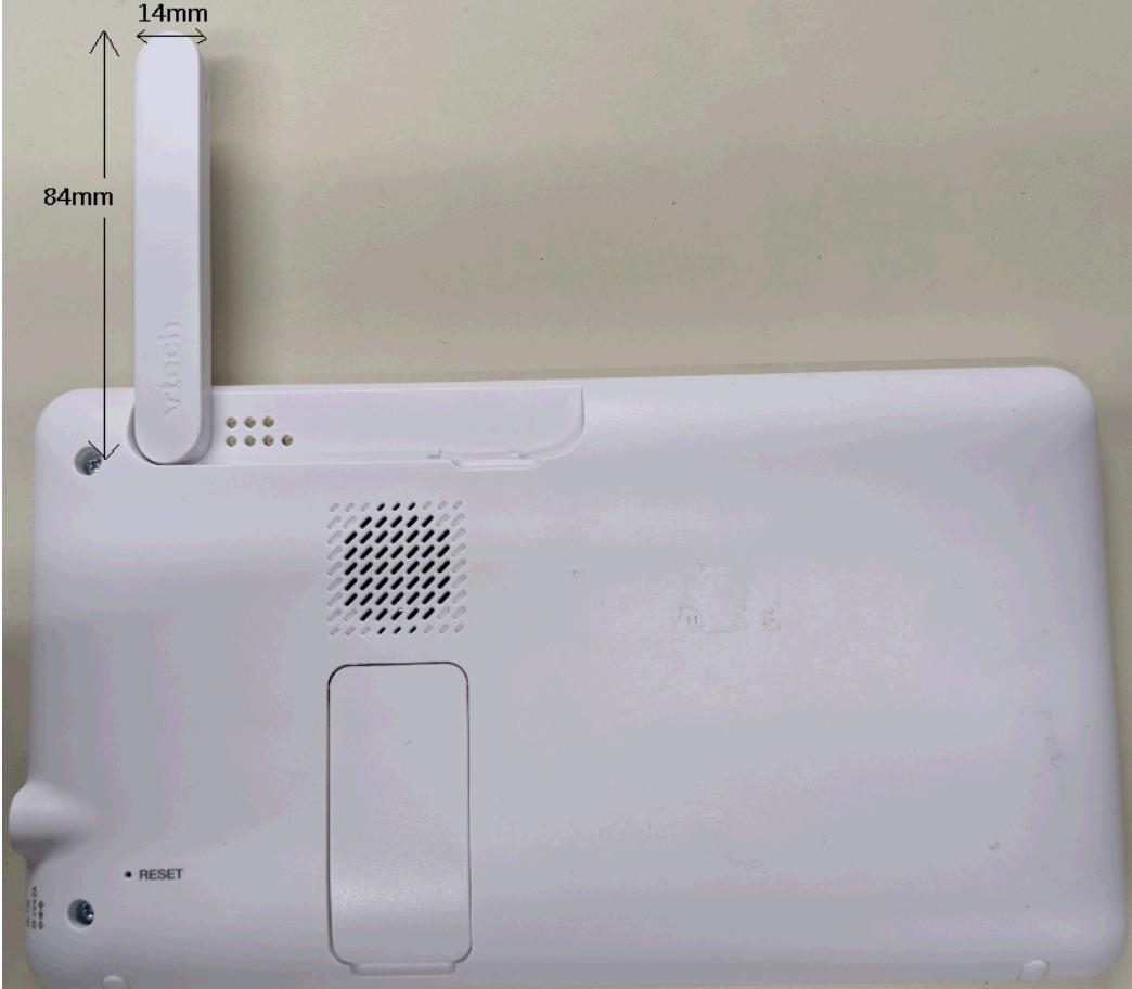
Figure 1 Physical dimension (mm)