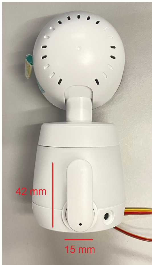
Figure 1 Physical dimension (mm)