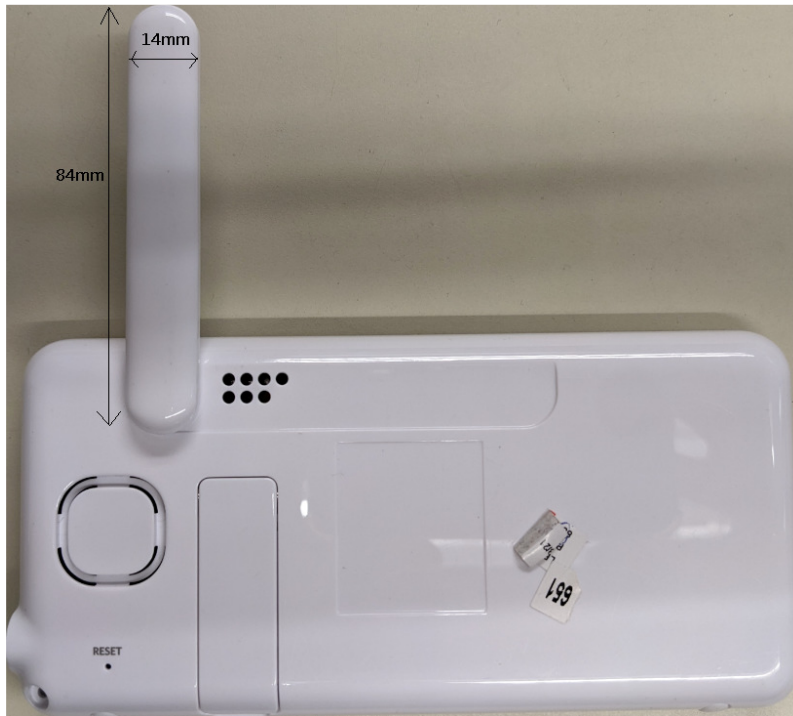
Figure 1 Physical dimension (mm)