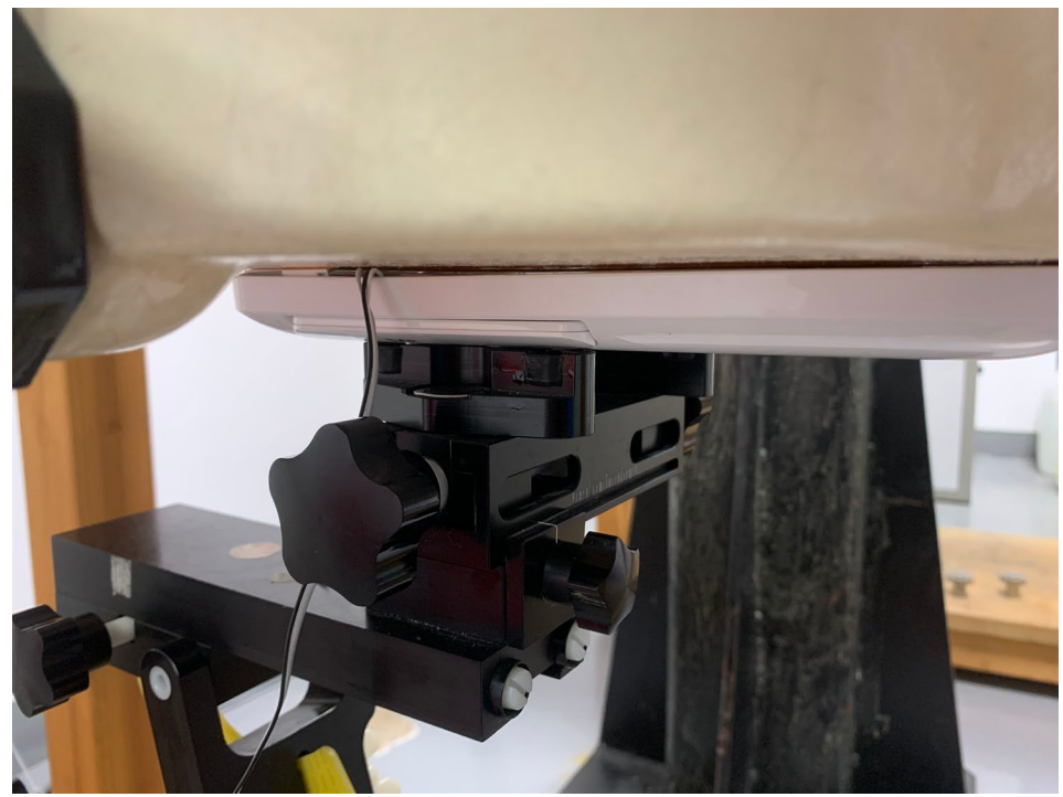
Figure 3 – Front with 0mm Separation