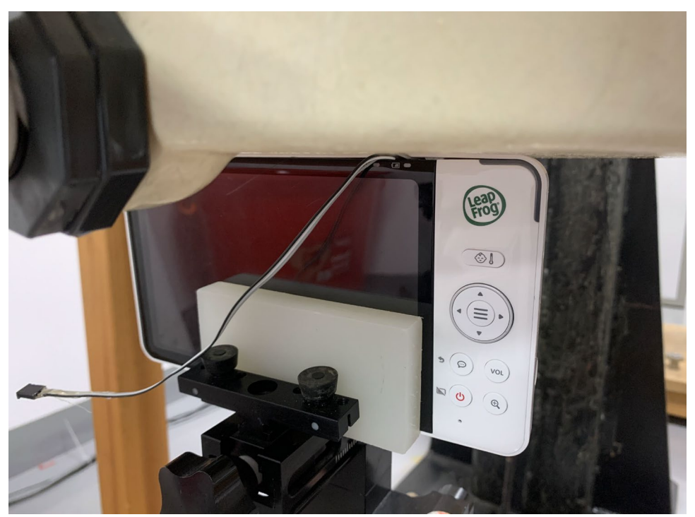
Figure 6 – Top with 0mm Separation