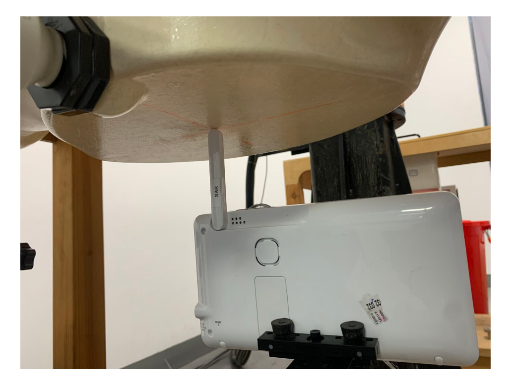
Figure 10 – Top with 0mm Separation (antenna extended)