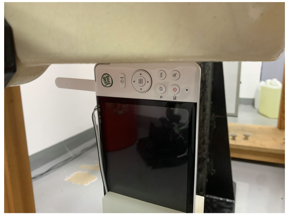
Figure 9 – Right with 0mm Separation (antenna extended)