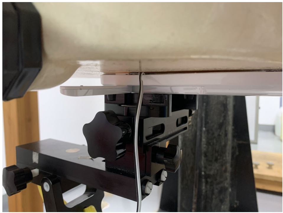
Figure 7 – Front with 0mm Separation (antenna extended)