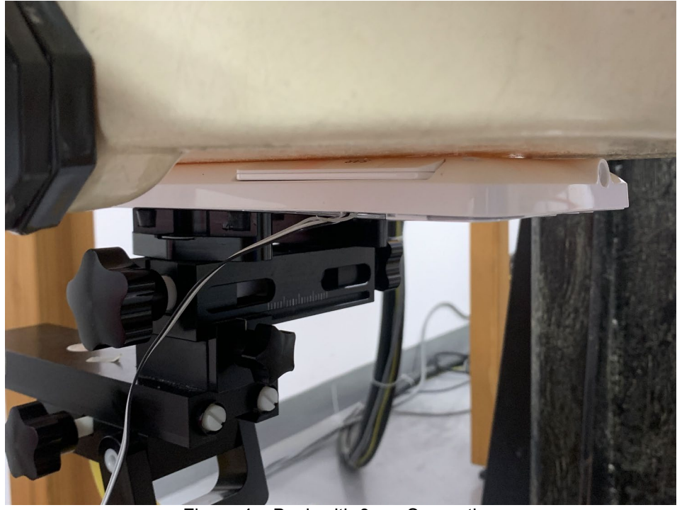
Figure 4 – Back with 0mm Separation