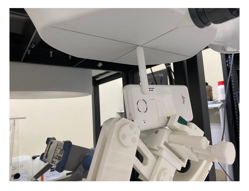
Figure 10 – Top with 0mm Separation (antenna extended)