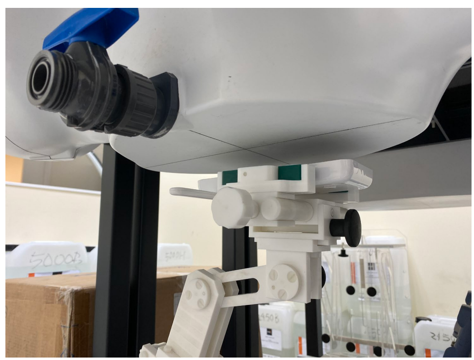
Figure 2 – Front with 25mm Separation (antenna extended)