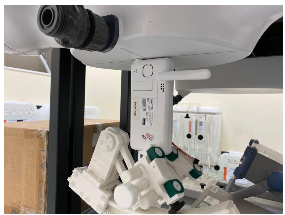
Figure 9 – Right with 0mm Separation (antenna extended)