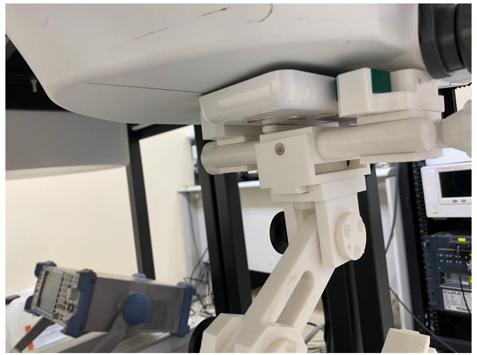
Figure 3 – Front with 0mm Separation