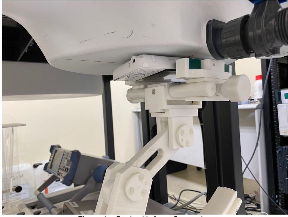
Figure 4 – Back with 0mm Separation