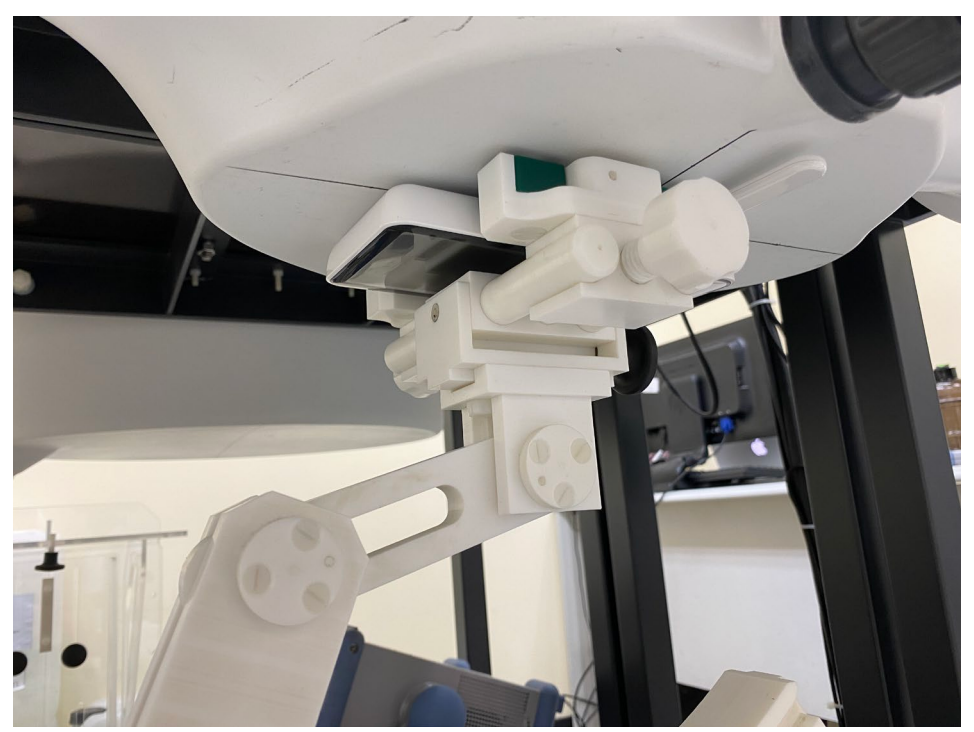
Figure 8 – Back with 0mm Separation (antenna extended)