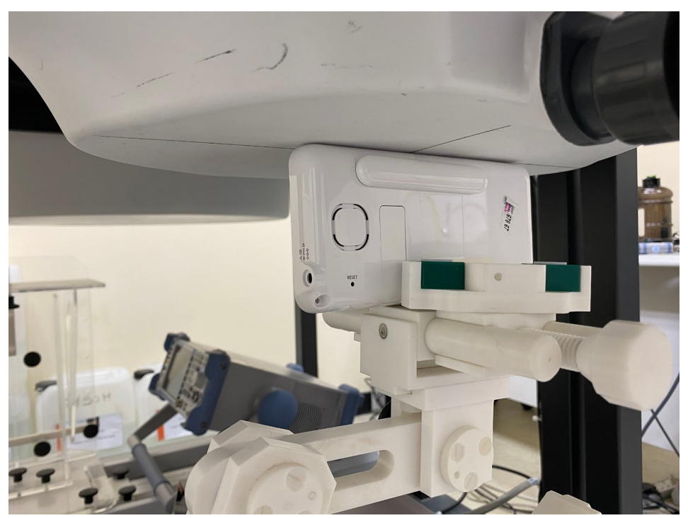
Figure 6 – Top with 0mm Separation