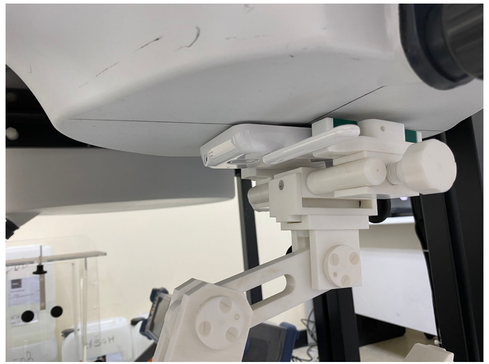
Figure 7 – Front with 0mm Separation (antenna extended)