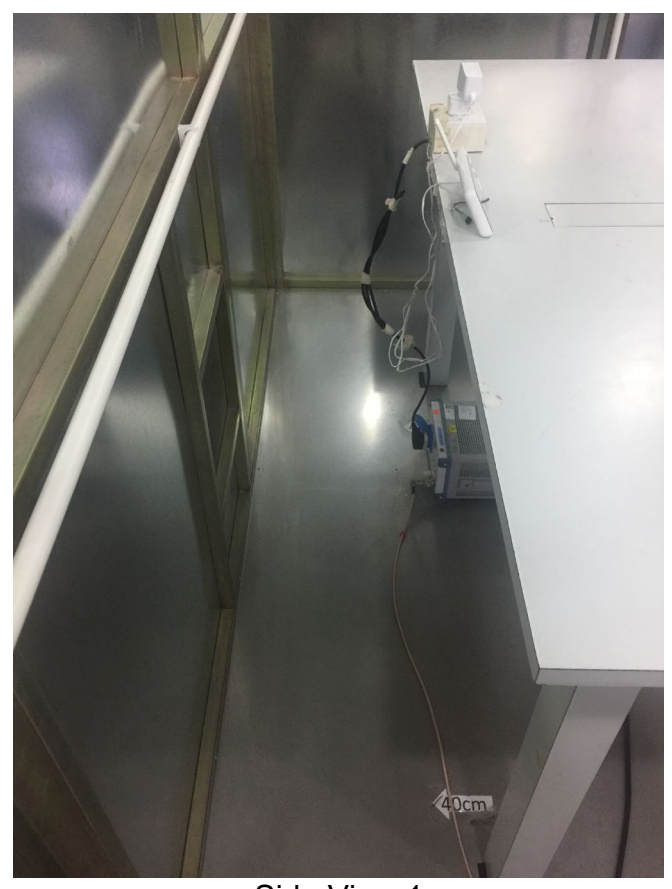
Side View 1

FCC ID: EW780-2517-01 IC: 1135B-80251701