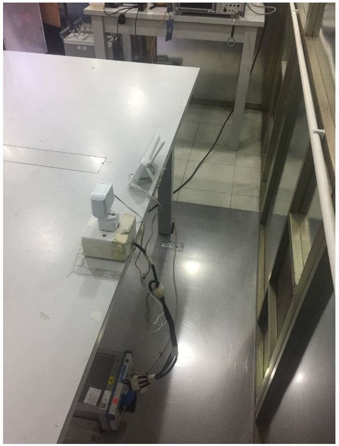
Side View 2

FCC ID: EW780-2517-01 IC: 1135B-80251701