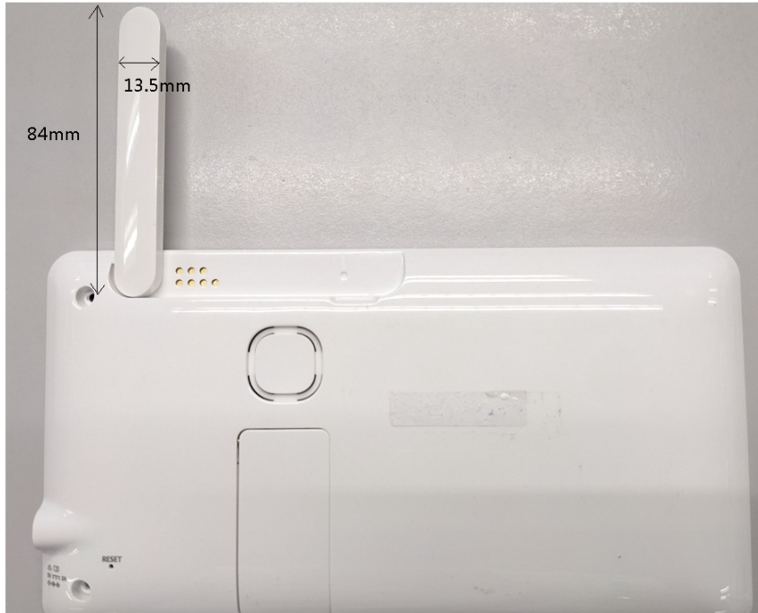
Figure 1 Physical dimension (mm)