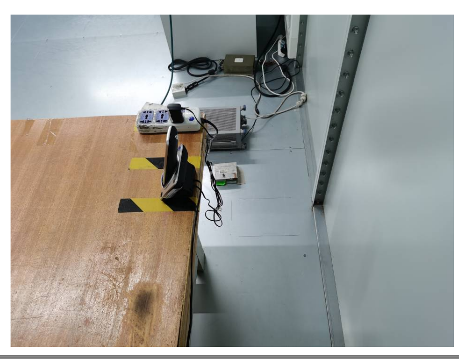
Page 1 of 3