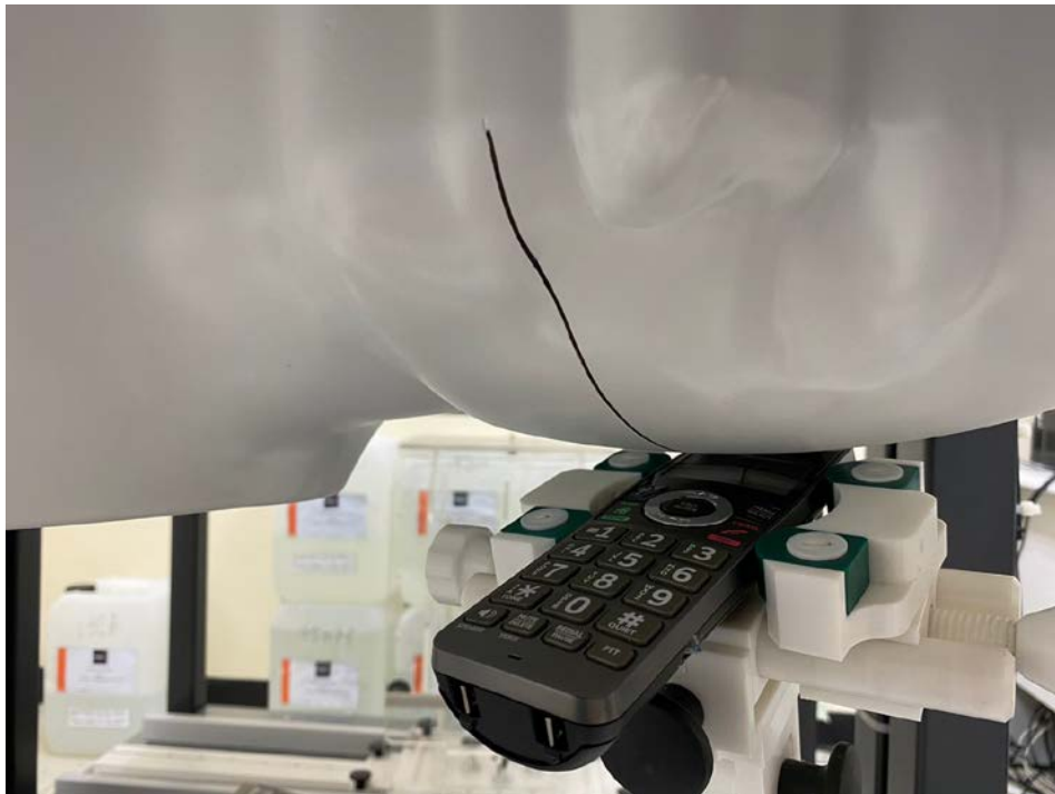
Figure 4 – Left Tilt