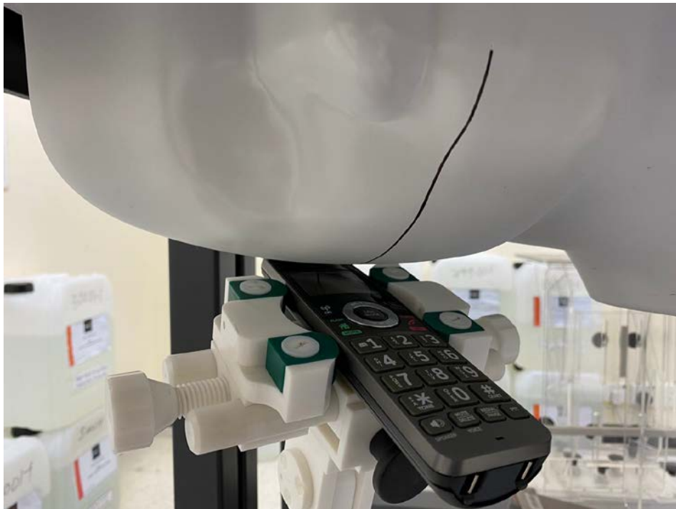
Figure 2 – Right Tilt