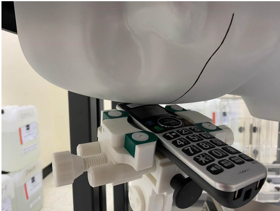
Figure 4 – Left Tilt