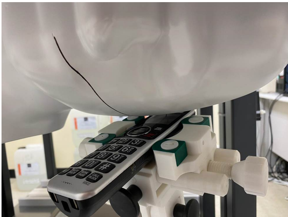
Figure 2 – Right Tilt