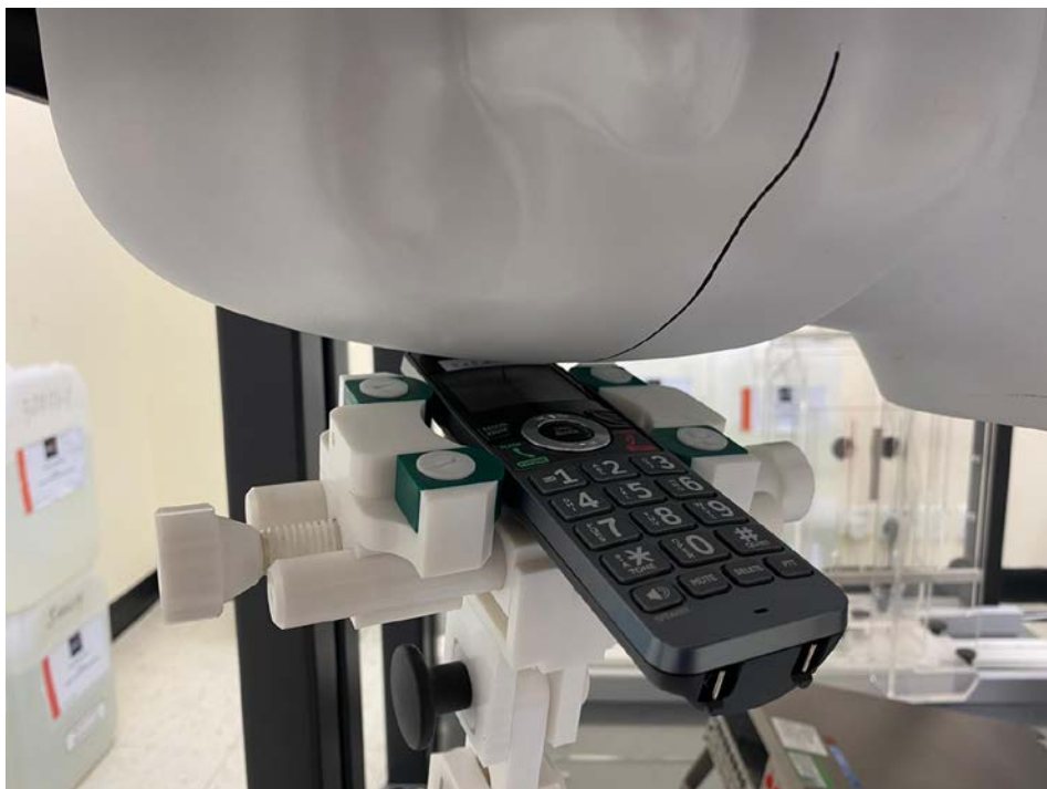
Figure 4 – Left Tilt