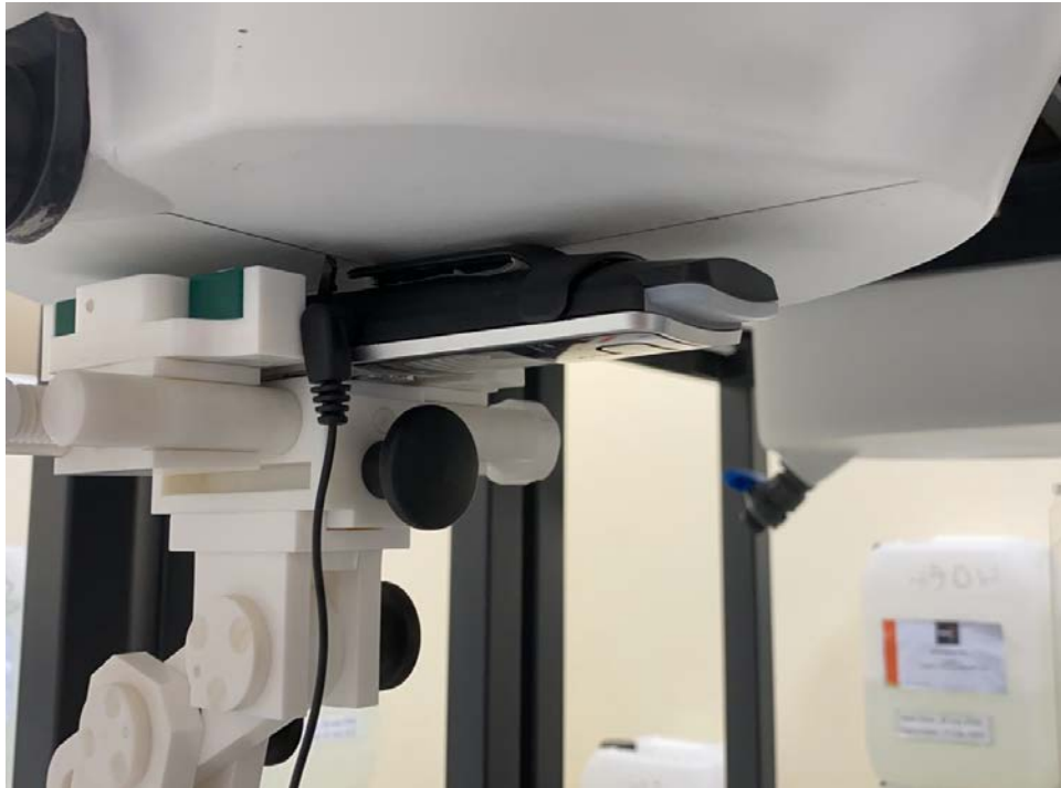
Figure 5 – Back surface with 0mm Separation