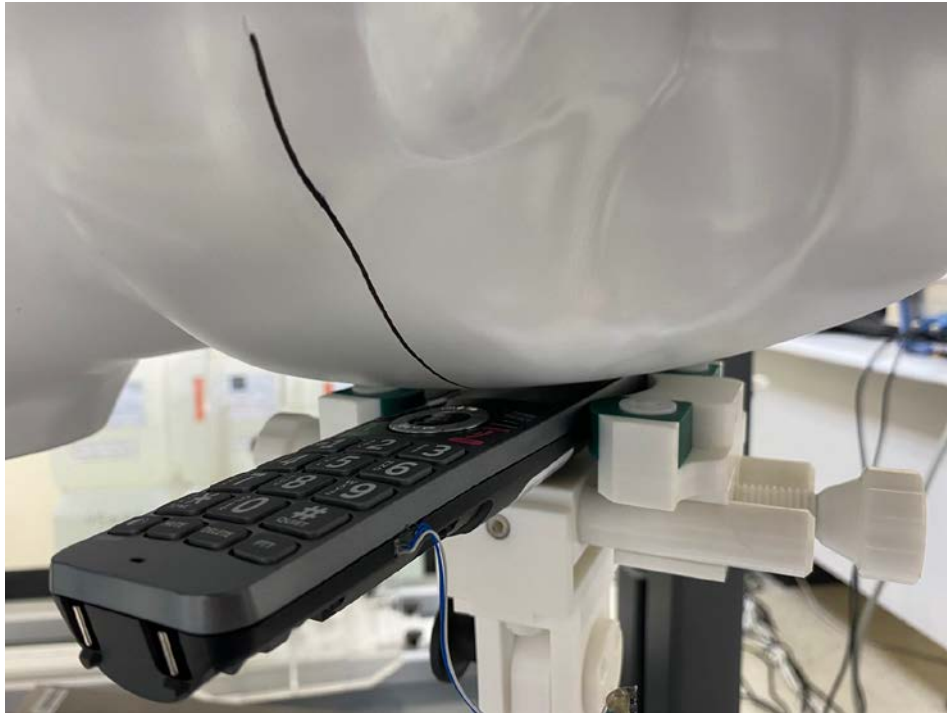
Figure 1 – Right Cheek