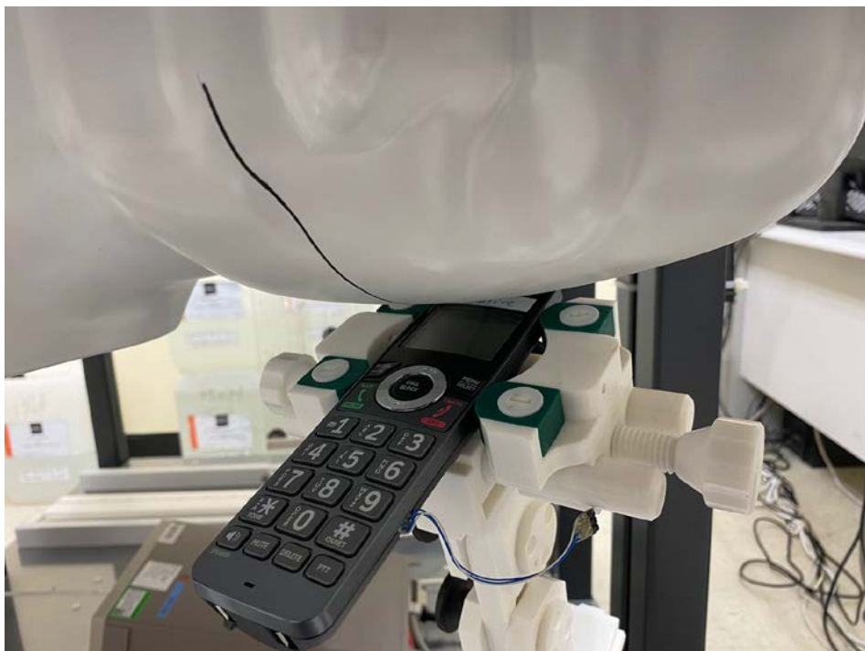
Figure 2 – Right Tilt