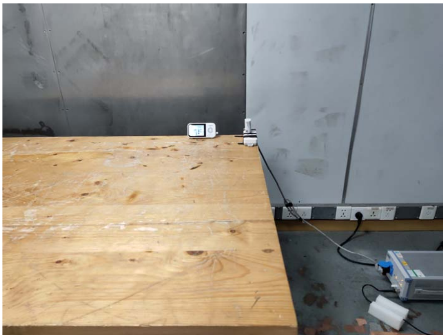
Photo of Conducted Emission Measurement