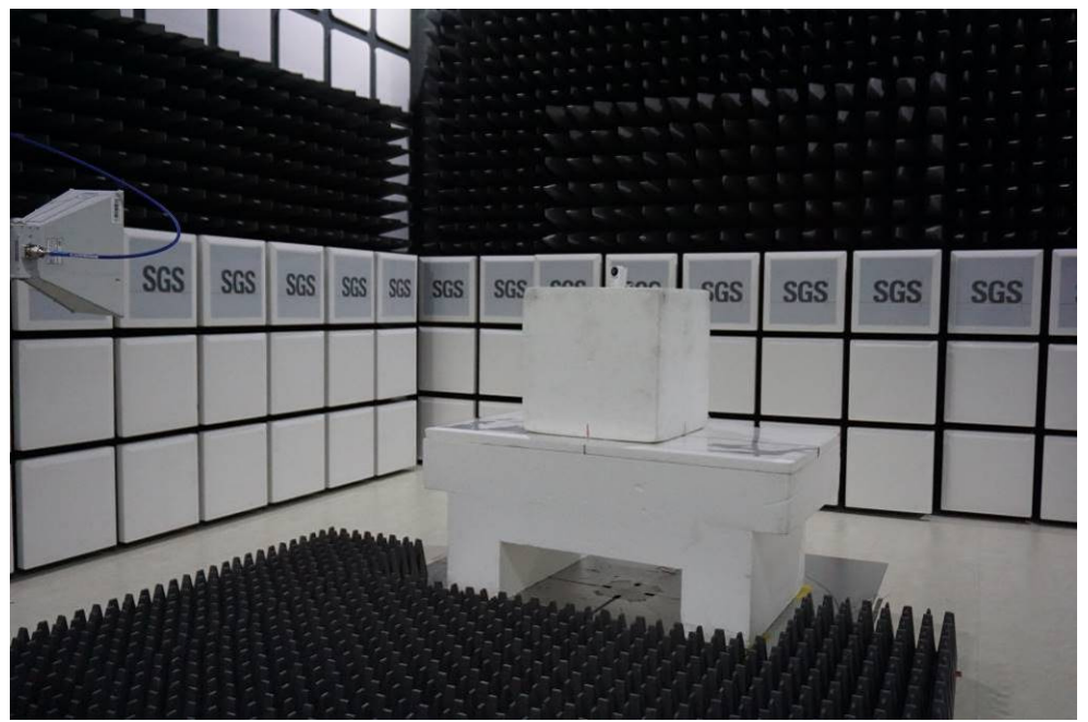
Conducted RF Test Setup