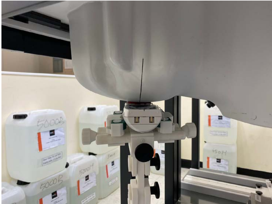
Figure 1 – Right Cheek