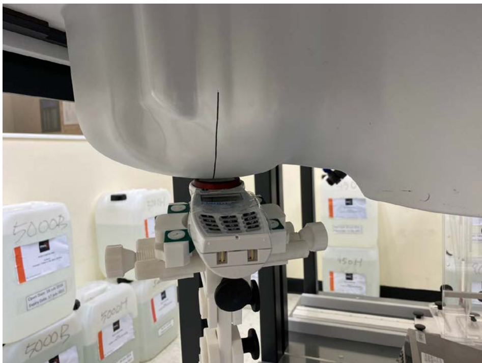
Figure 2 – Right Tilt