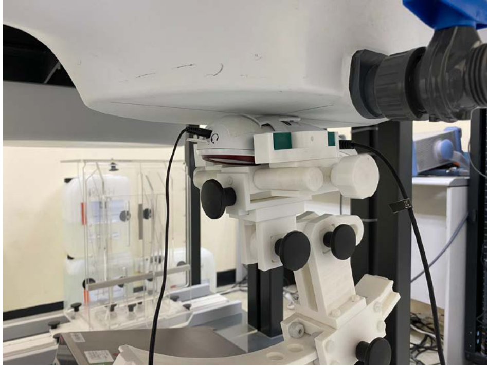
Back surface with 0mm Separation