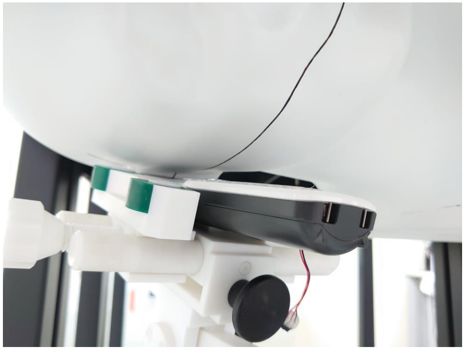
Figure 4 - Right Tilt