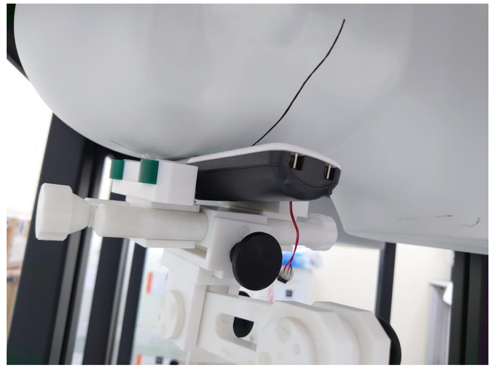
Figure 3 – Right Cheek