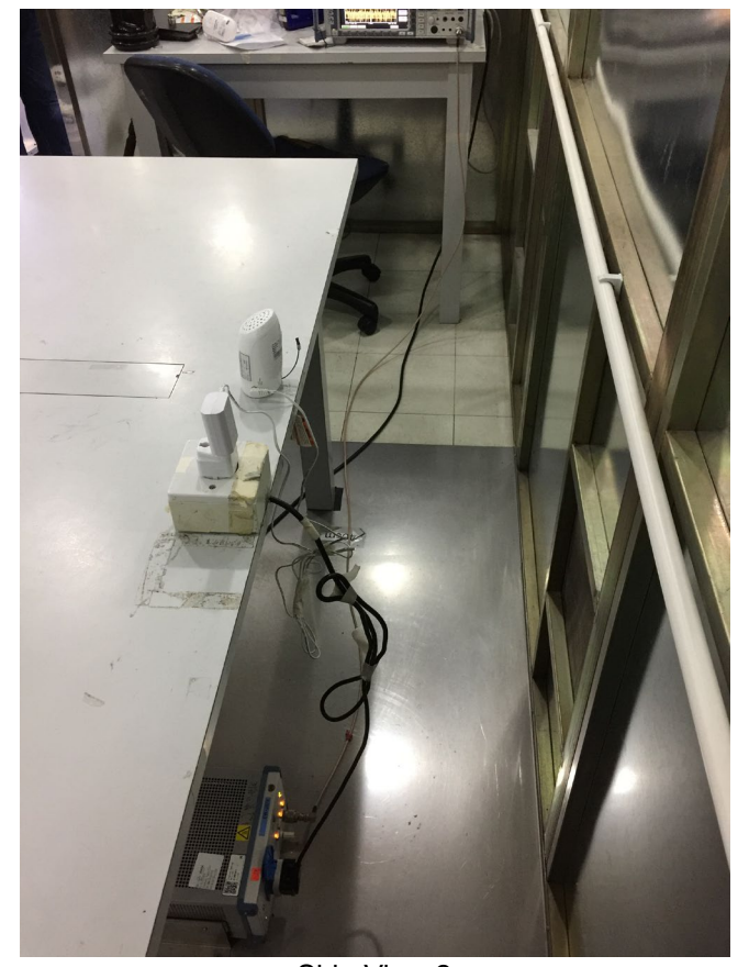
Side View 2

FCC ID: EW780-1496-00 IC: 1135B-80149600