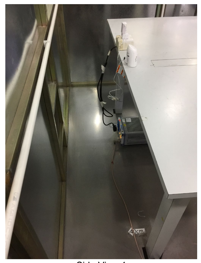
Side View 1

FCC ID: EW780-1496-00 IC: 1135B-80149600