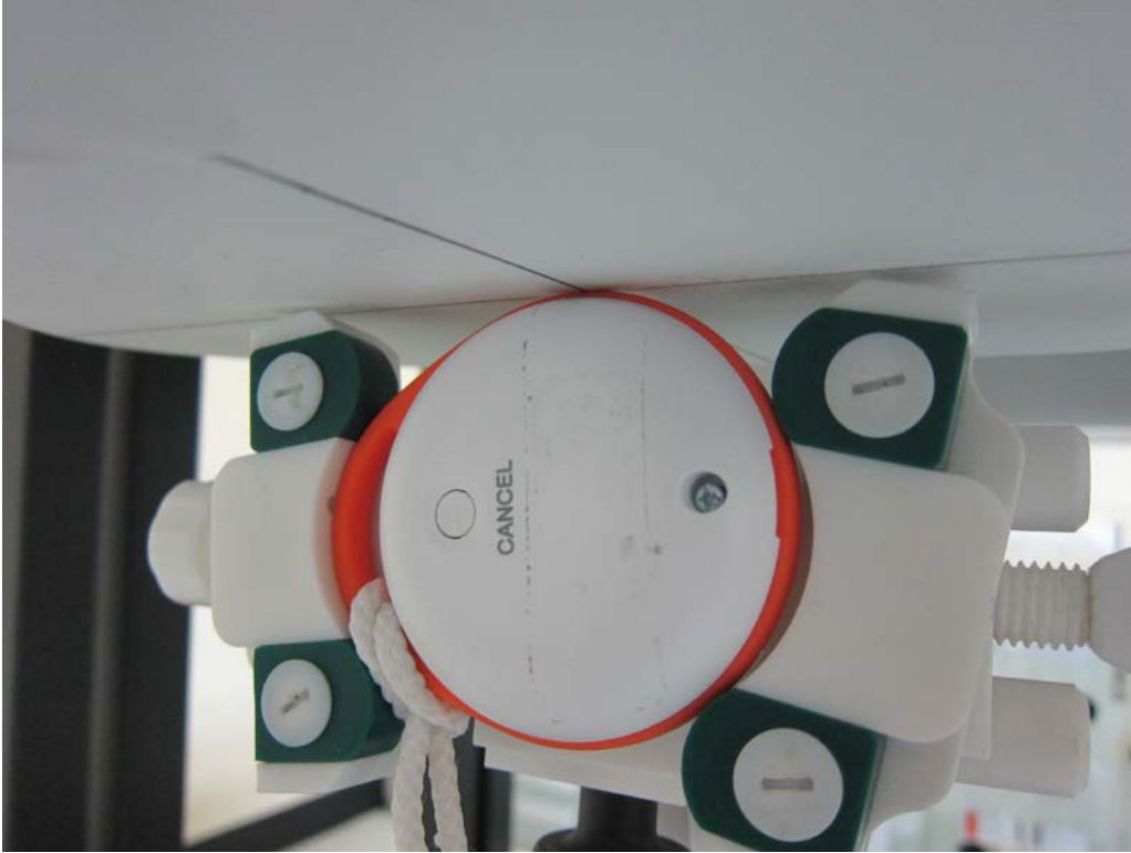
Figure 3 – Left surface with 0mm Separation