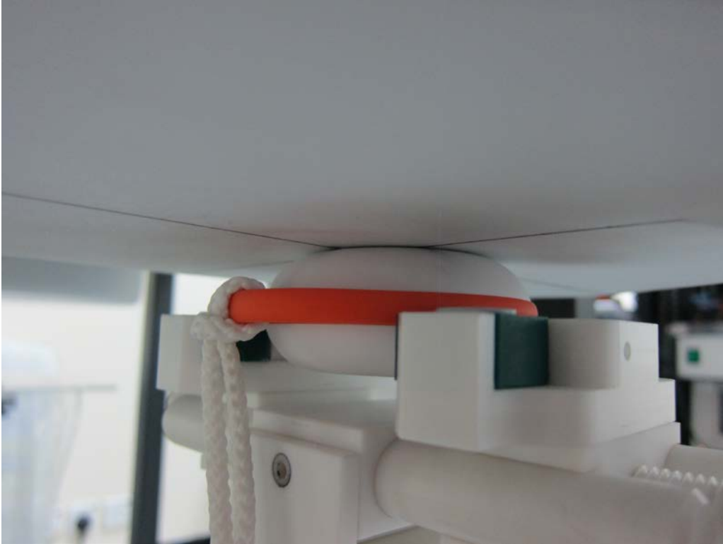
Figure 2 – Front surface with 0mm Separation