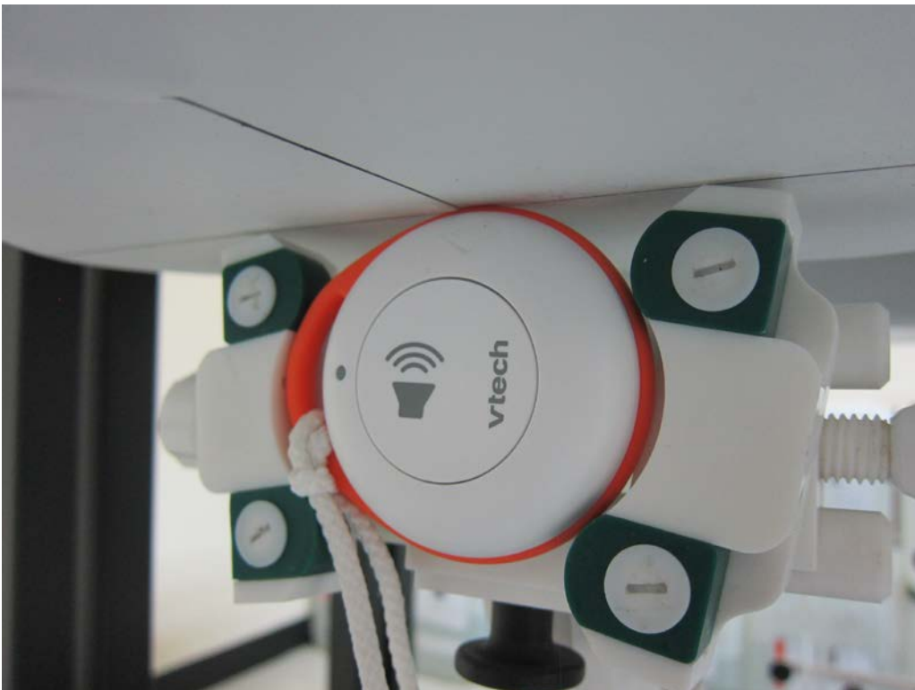
Figure 4 – Right surface with 0mm Separation