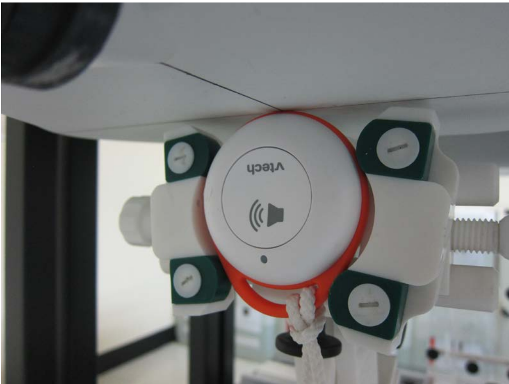
Figure 6 – Bottom surface with 0mm Separation