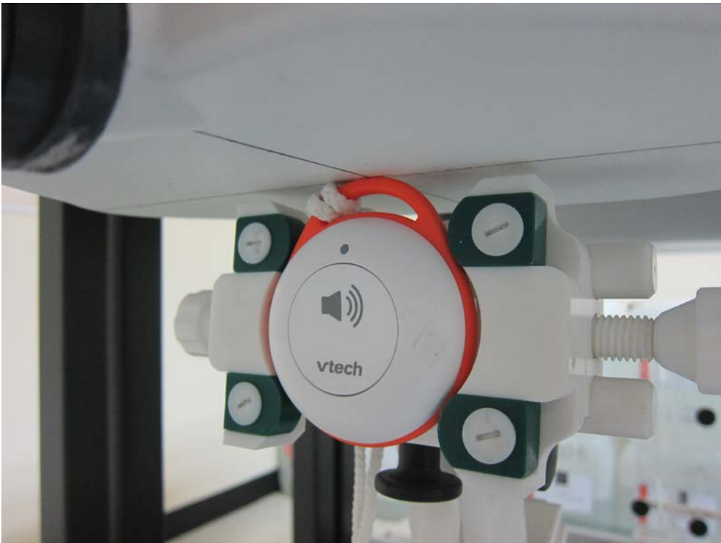
Figure 2 – Top surface with 0mm Separation