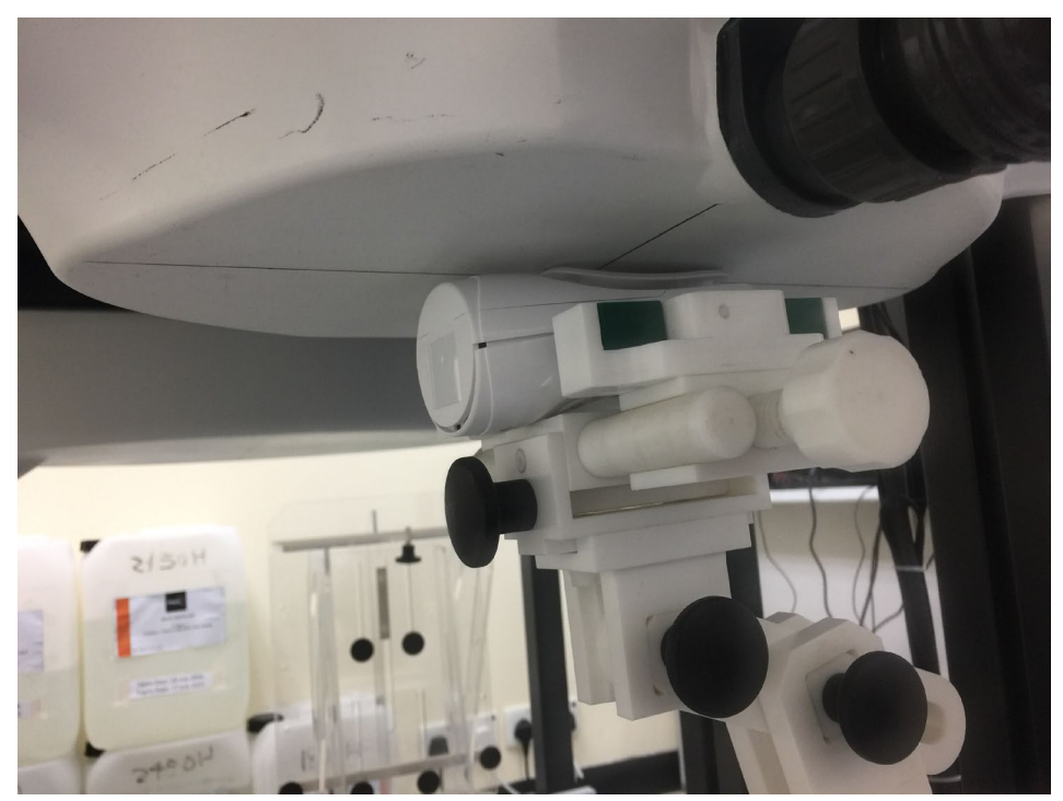
Figure 2 – Back with 0mm Separation

FCC ID: EW780-1410-01 IC: 1135B-80141001