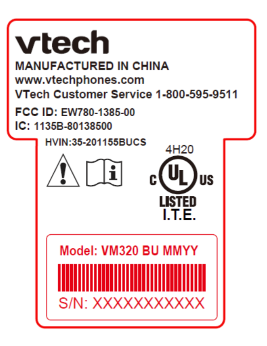
FCC ID Label Location Information