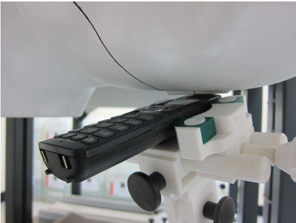
Figure 2 – Left Tilt