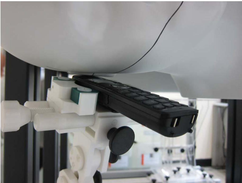
Figure 4 – Right Tilt