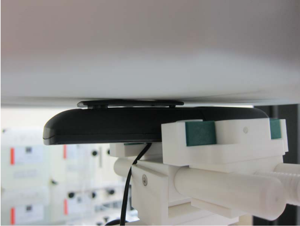
Figure 5 – Back surface with 0mm Separation