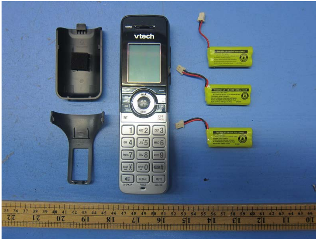
Figure 1 - Front View