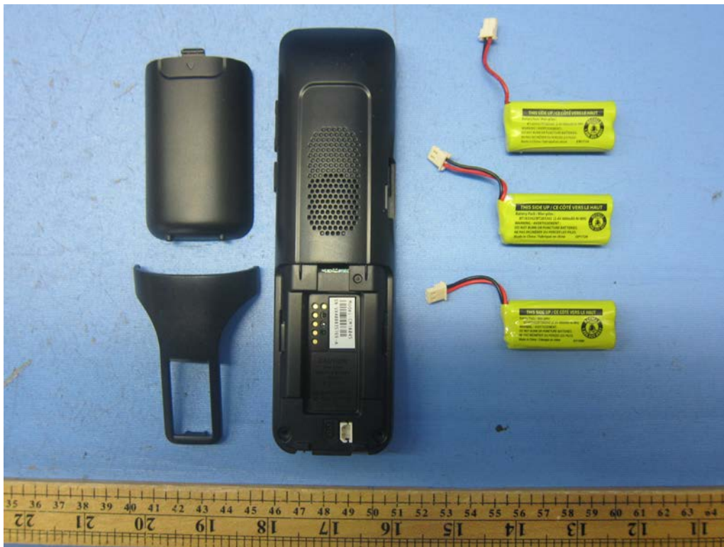
Figure 2 - Back View