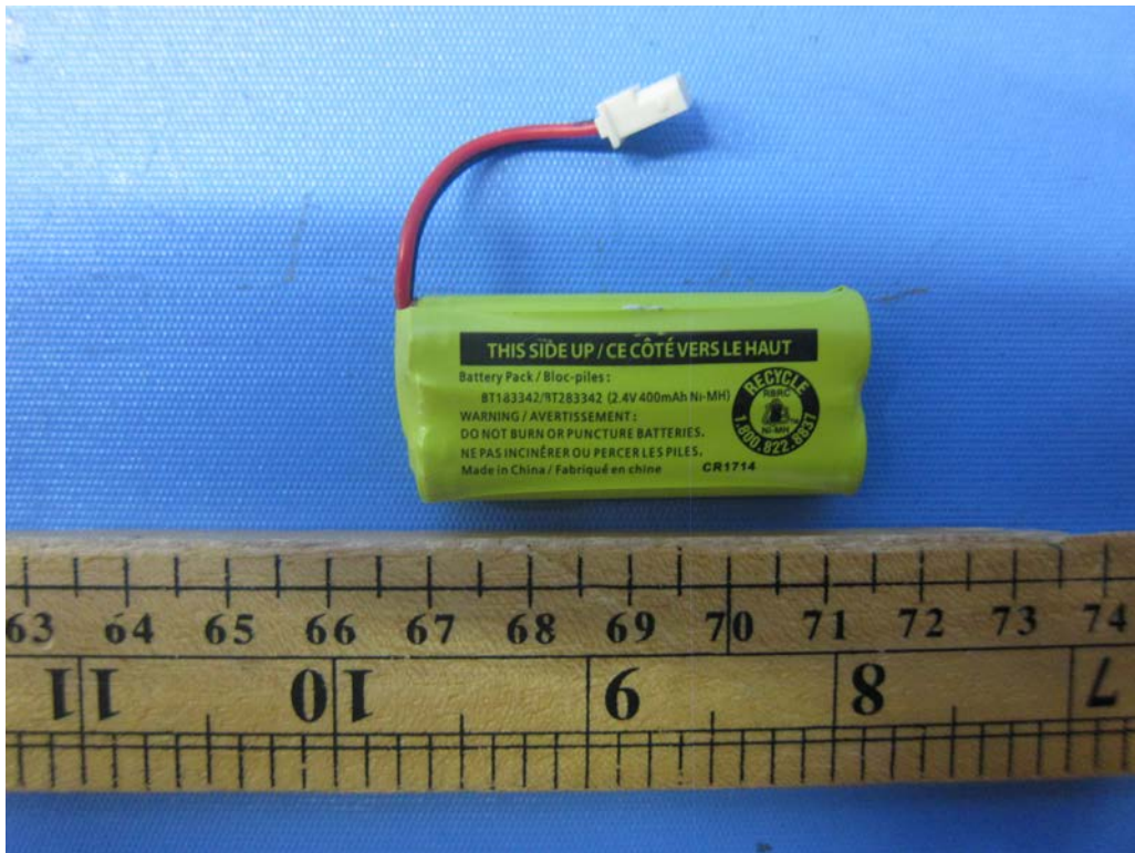
Figure 4 - 2.4V 400mAh Courn Ni-MH rechargeable battery