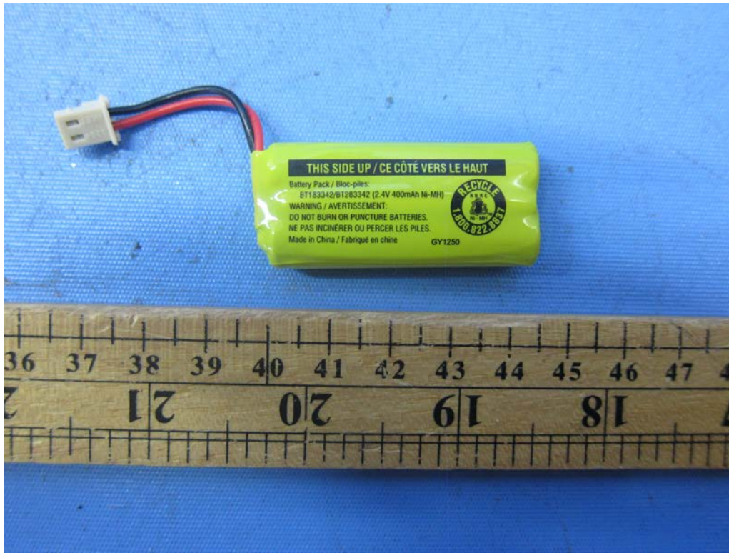
Figure 5 - 2.4V 400mAh Coslight Ni-MH rechargeable battery