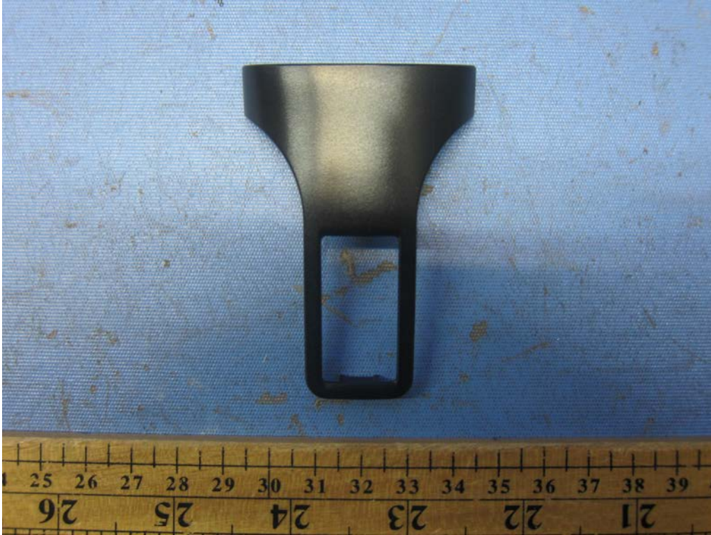
Figure 7 – Belt-Clip Back View