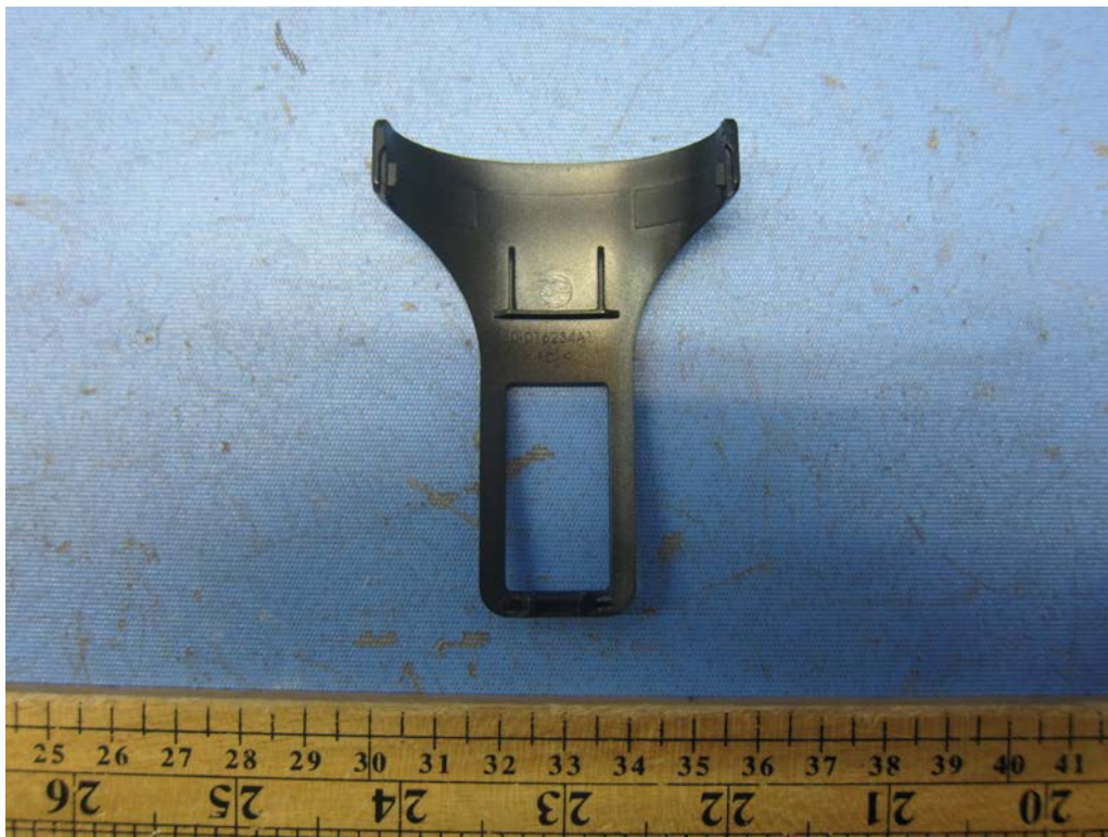
Figure 6 – Belt-Clip Front View