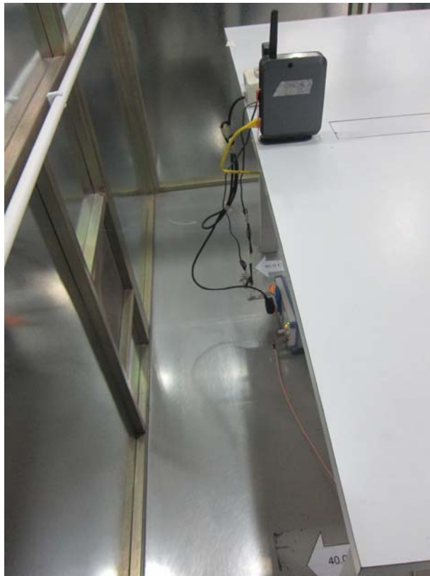
Side View 1

Test Report Number: 17081471HKG-001 FCC ID: EW780-1363-00 IC: 1135B-80136300