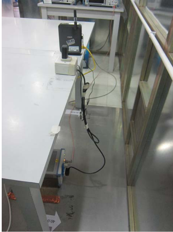
Side View 2