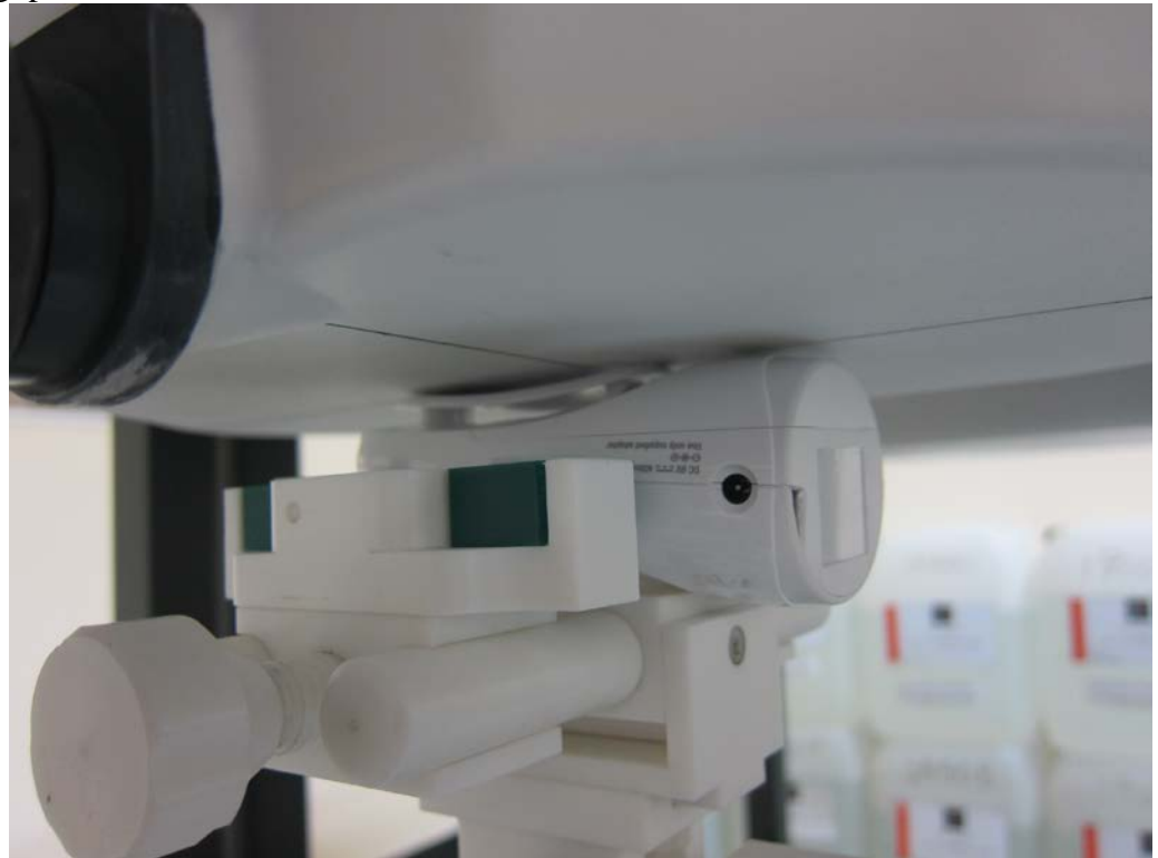
Figure 1 – Back surface with 0mm Separation