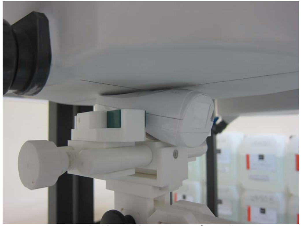
Figure 2 – Front surface with 0mm Separation