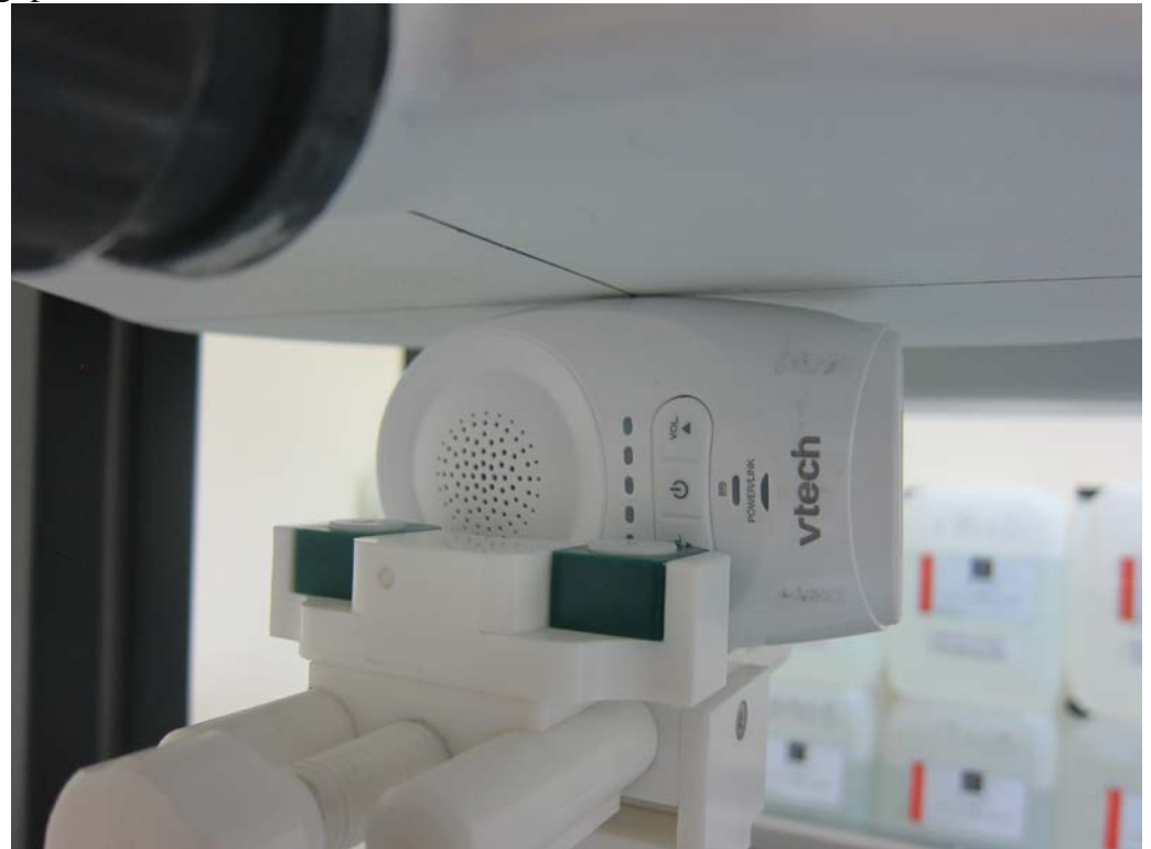
Figure 5 – Right surface with 0mm Separation