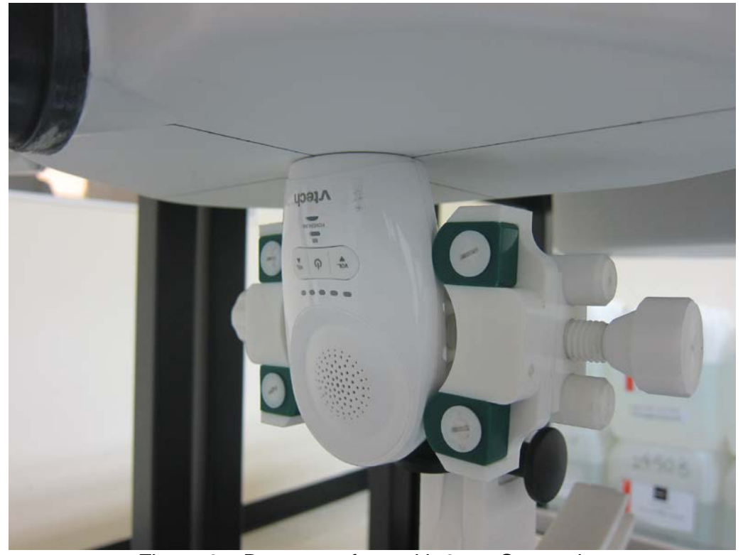
Figure 6 – Bottom surface with 0mm Separation